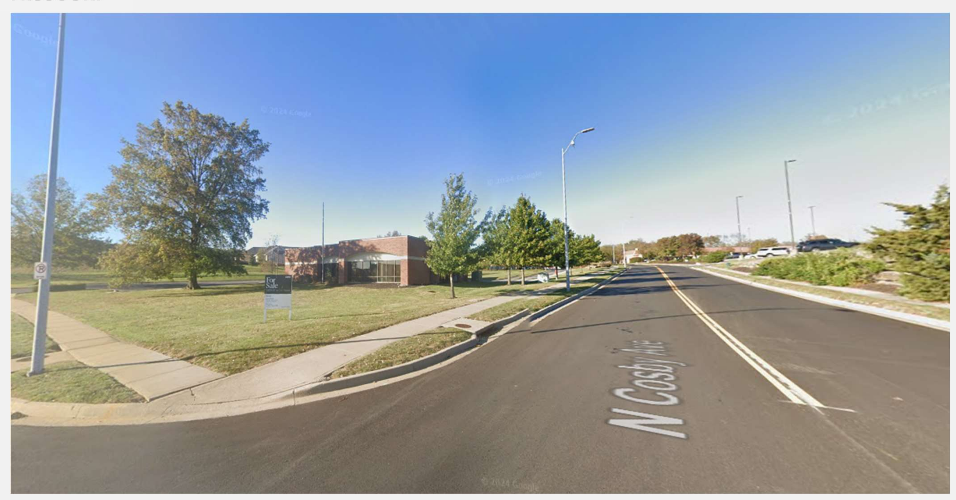
View looking north on N. Cosby Avenue