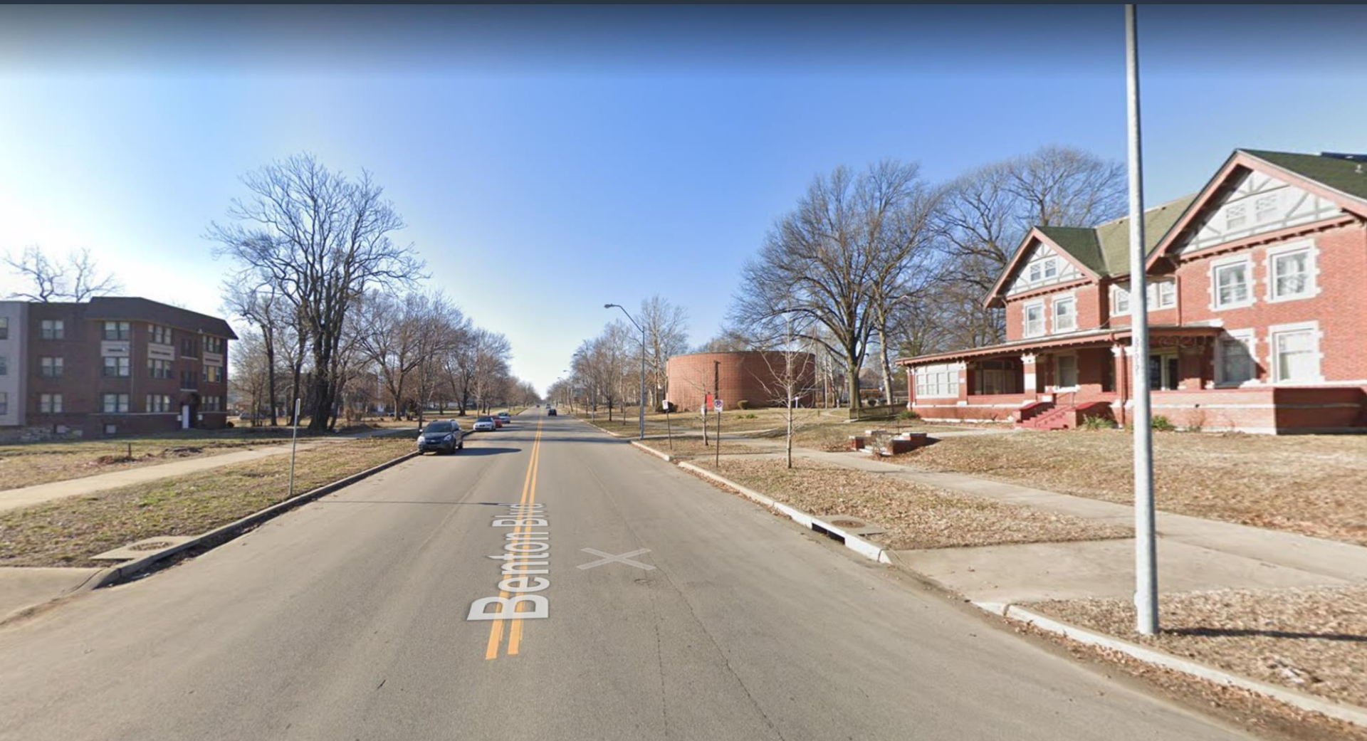
View looking south on Benton Blvd from Lockridge Ave