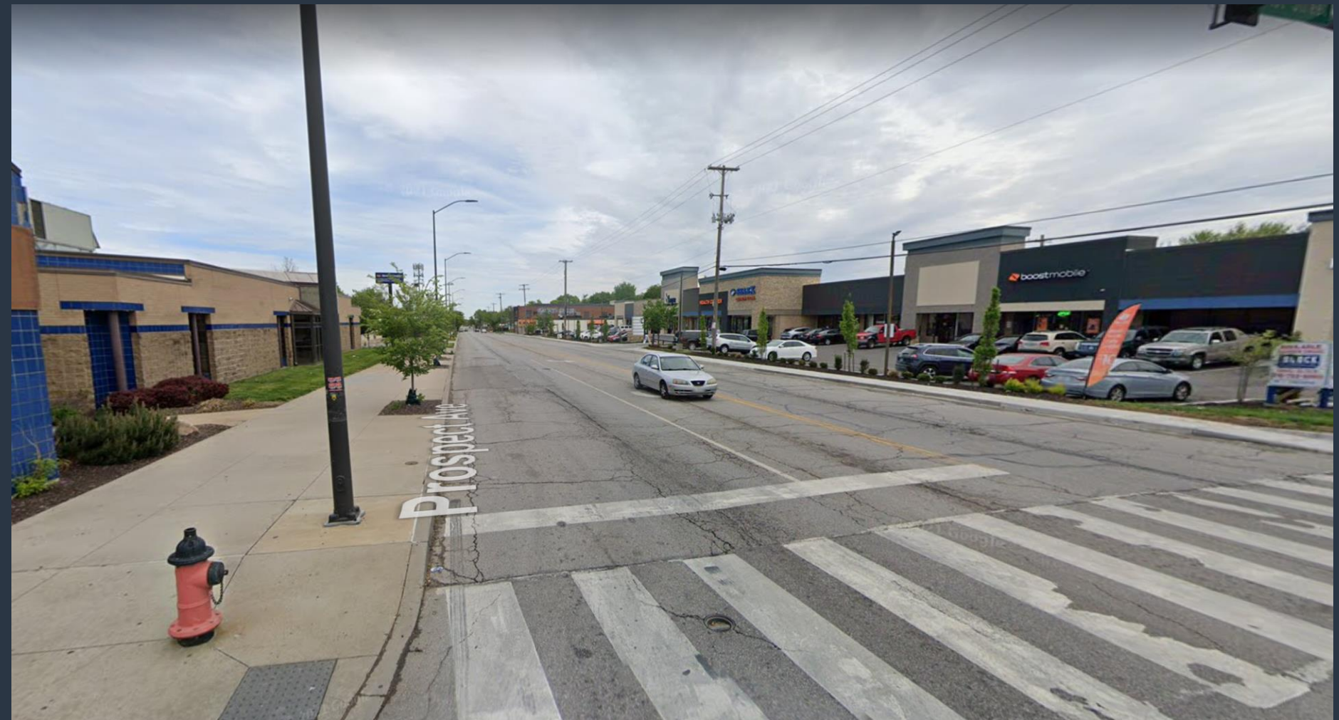
View looking north on Prospect Ave from 31 st St