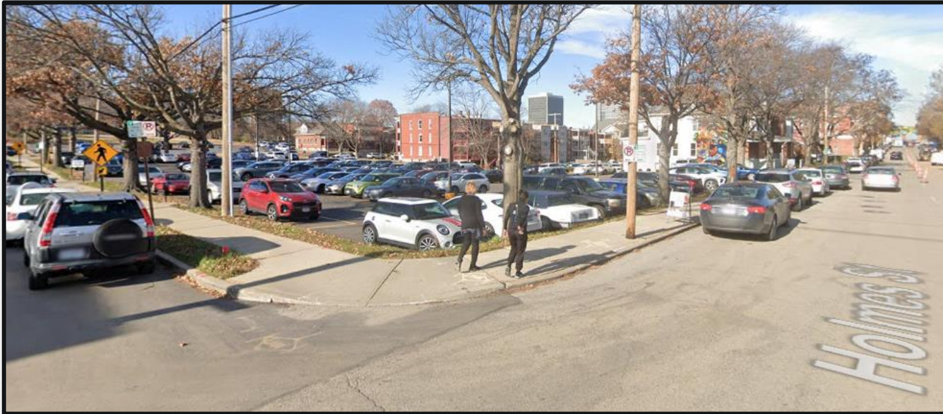
Google Street View, looking northwest up Holmes St.