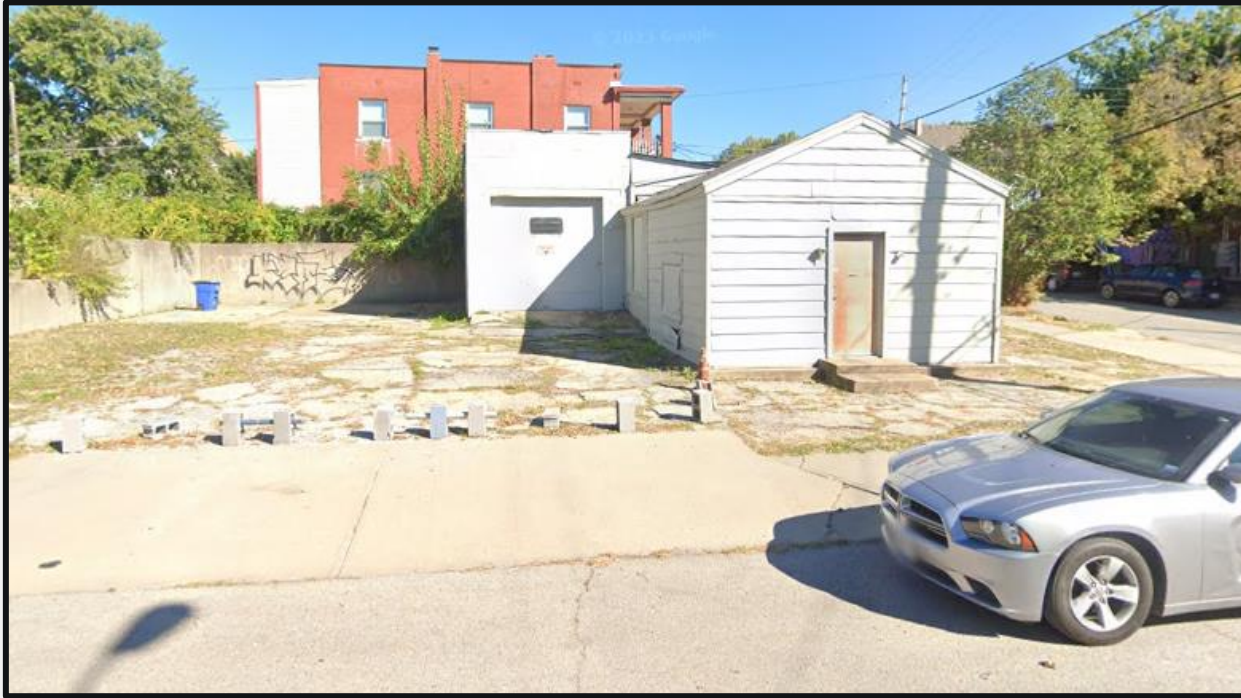
Google Street View, September 2022 view of the subject site.