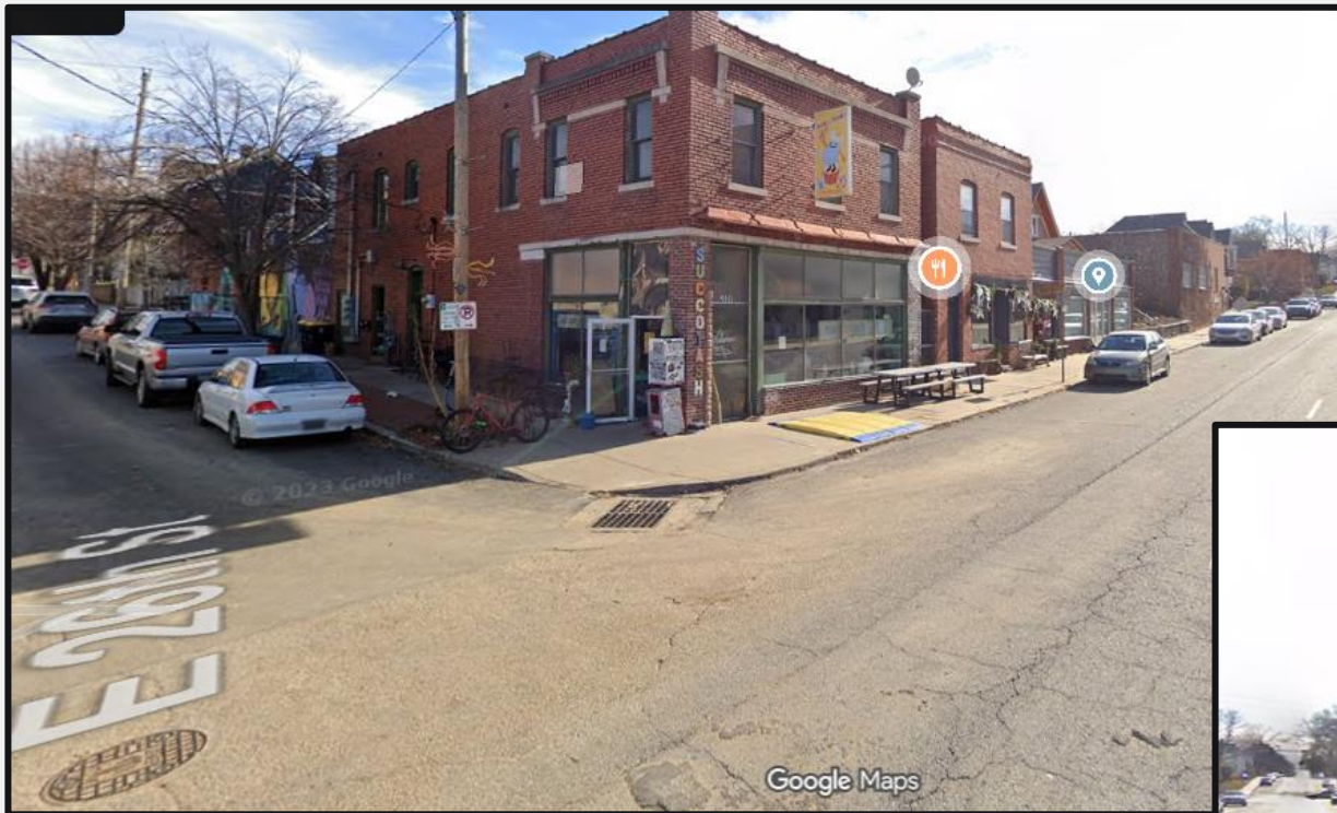
looking southeast down Holmes St.