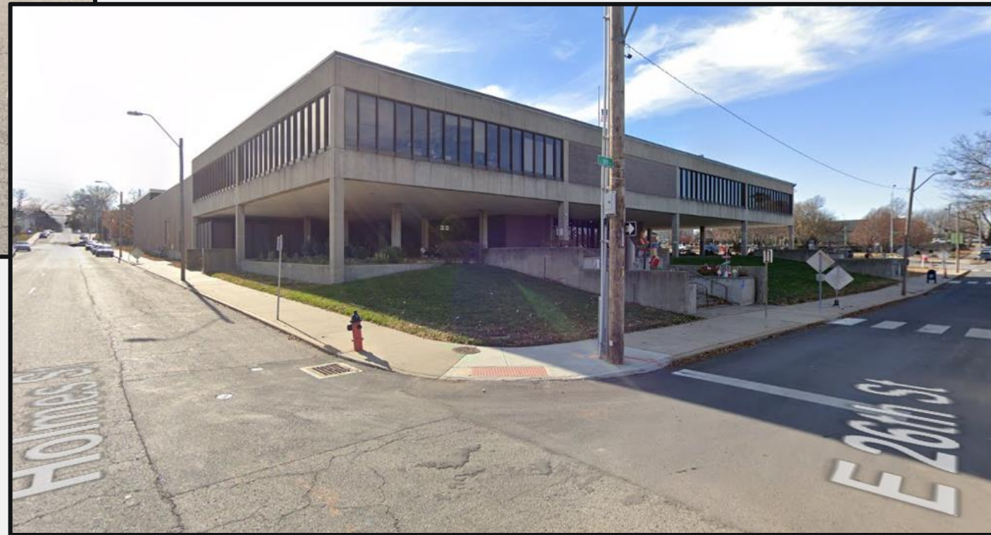
Google Street View, looking southwest down Holmes St.