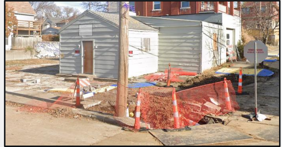
Google Street View, December 2023 view of the subject site.