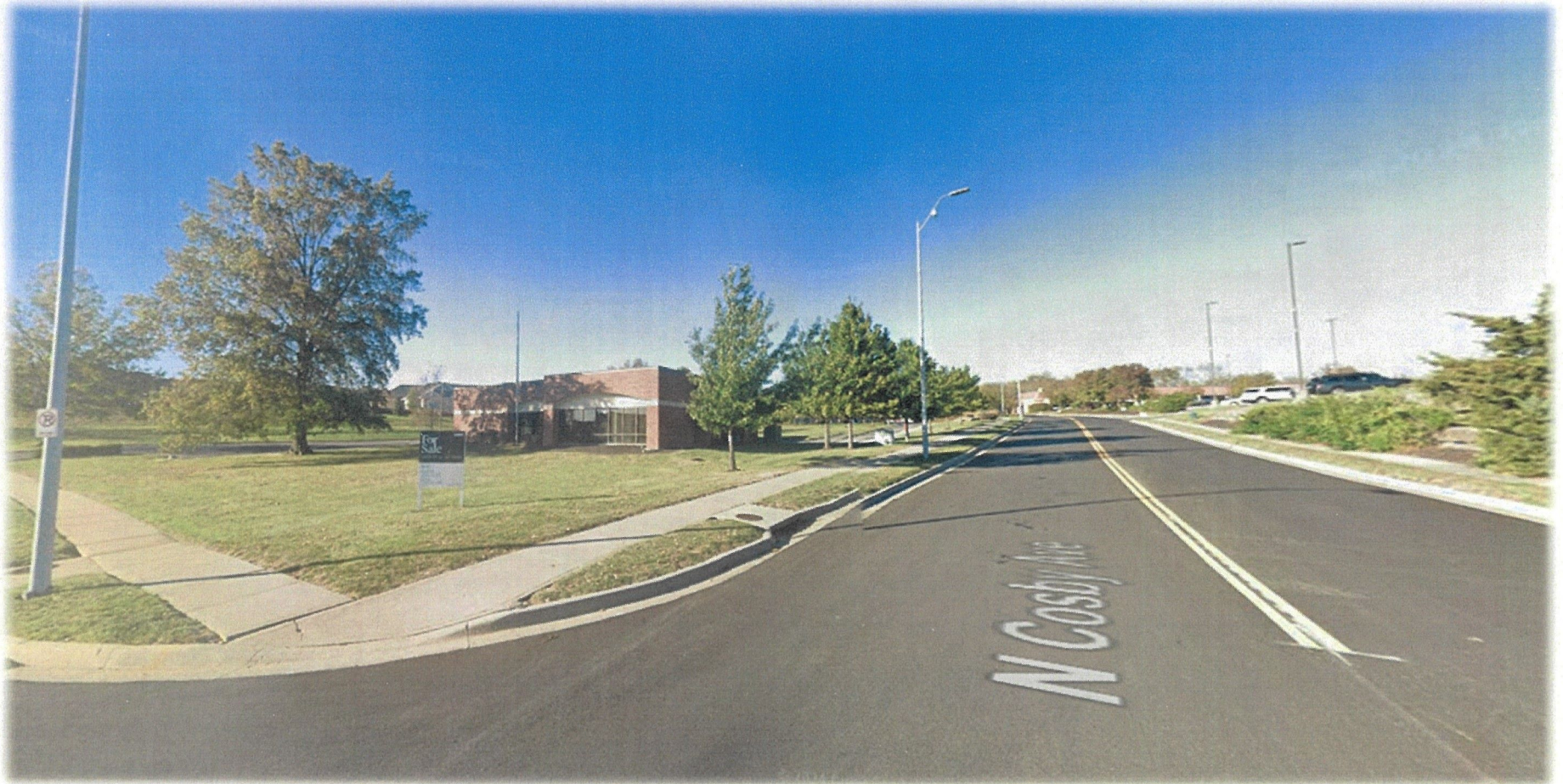
View looking north on N. Cosby Avenue