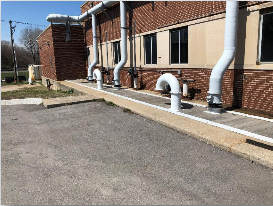
Blue River Screen House Exterior