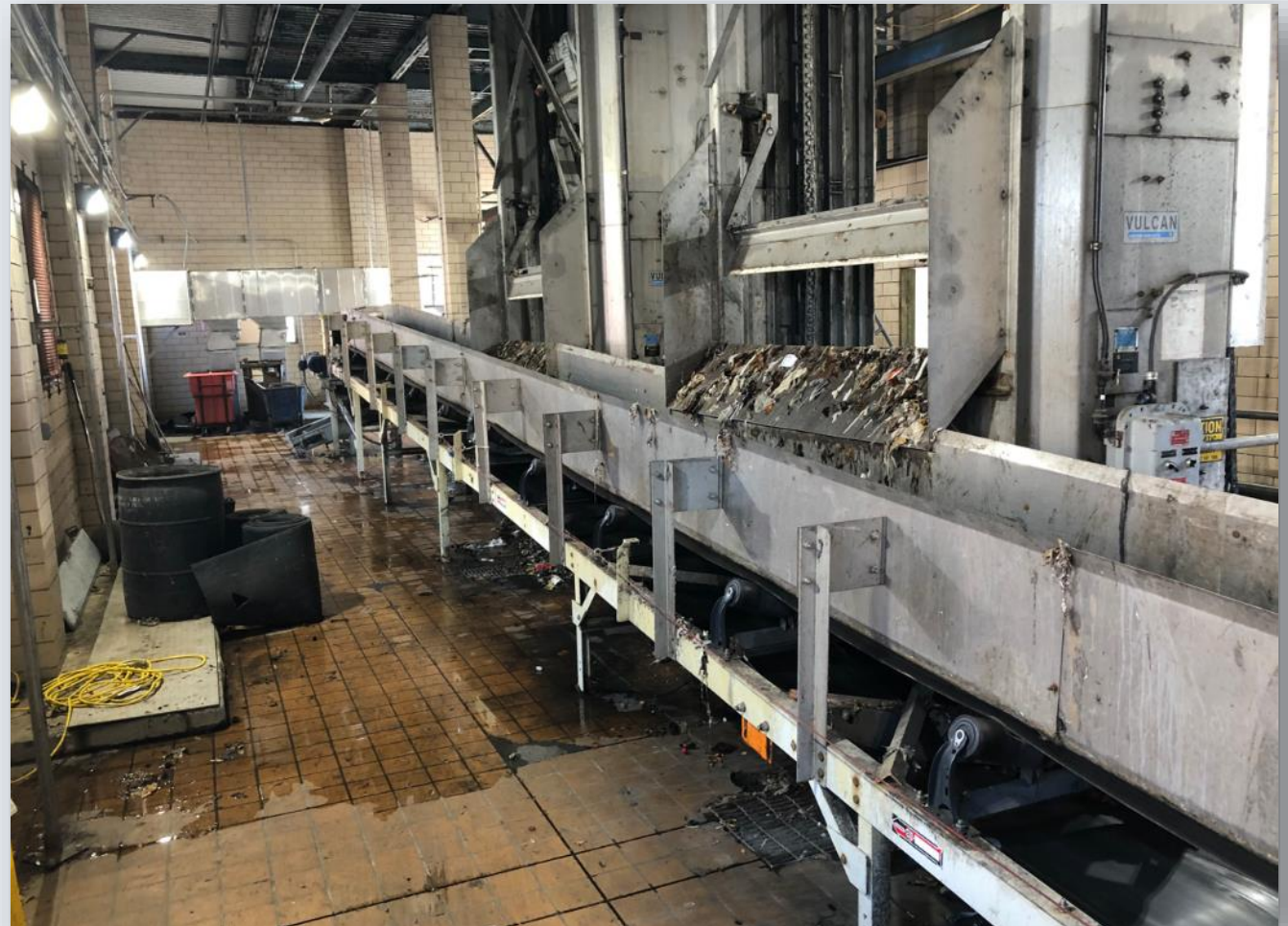
Existing Screenings Conveyor