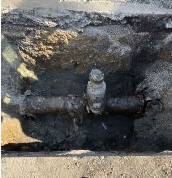
Old Water Valve