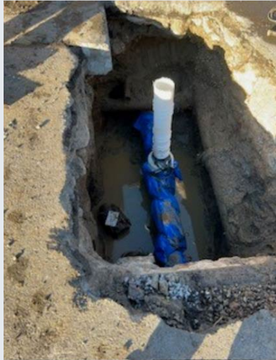
New Water Valve with Poly Wrap Installed