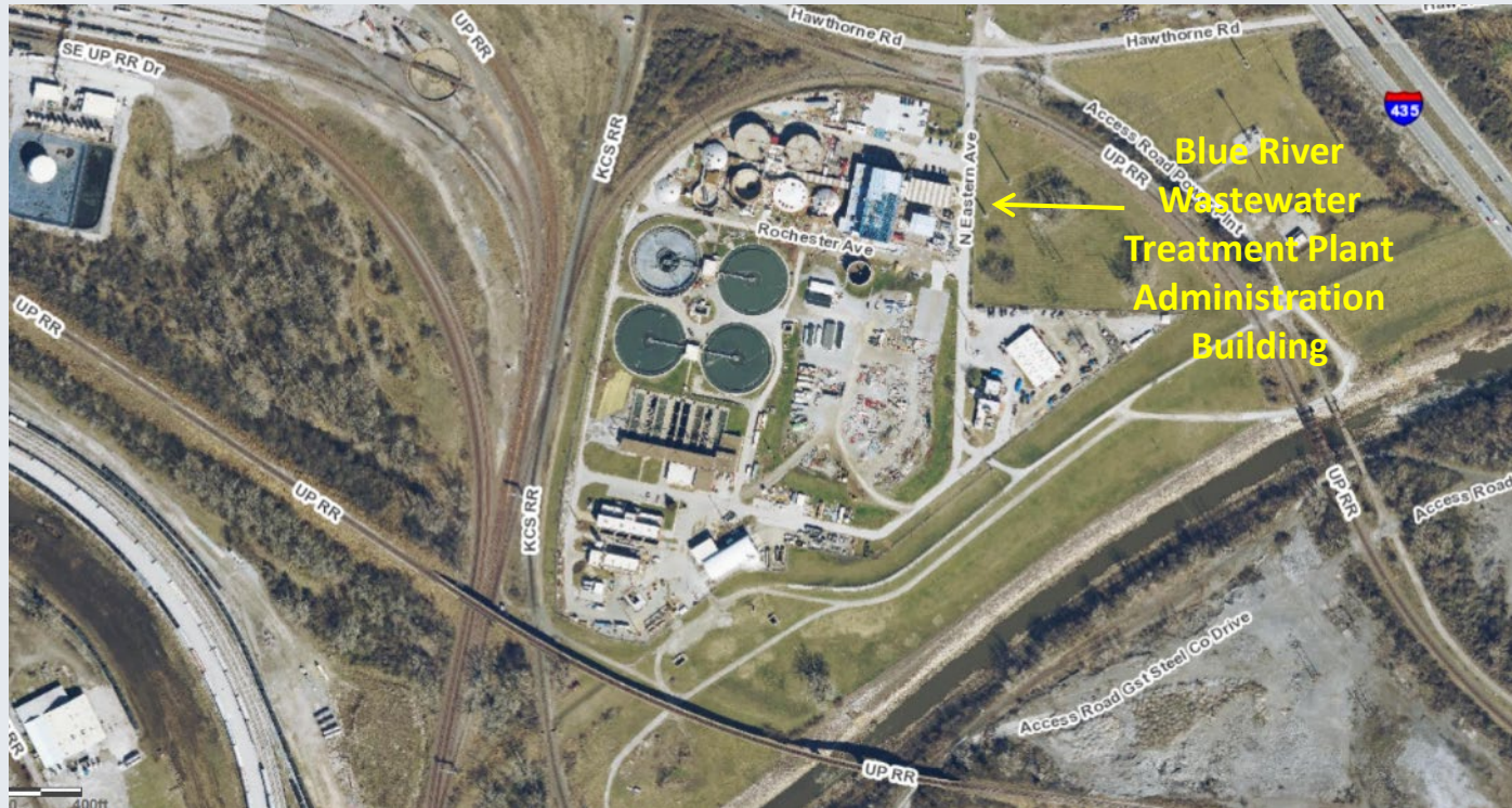
Blue River Wastewater Treatment Plant Map