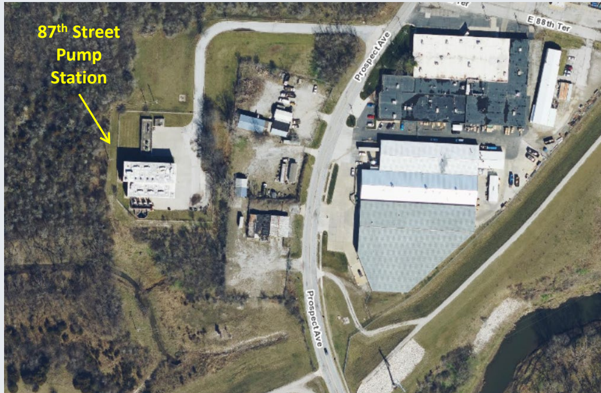
87 th Street Pump Station Map