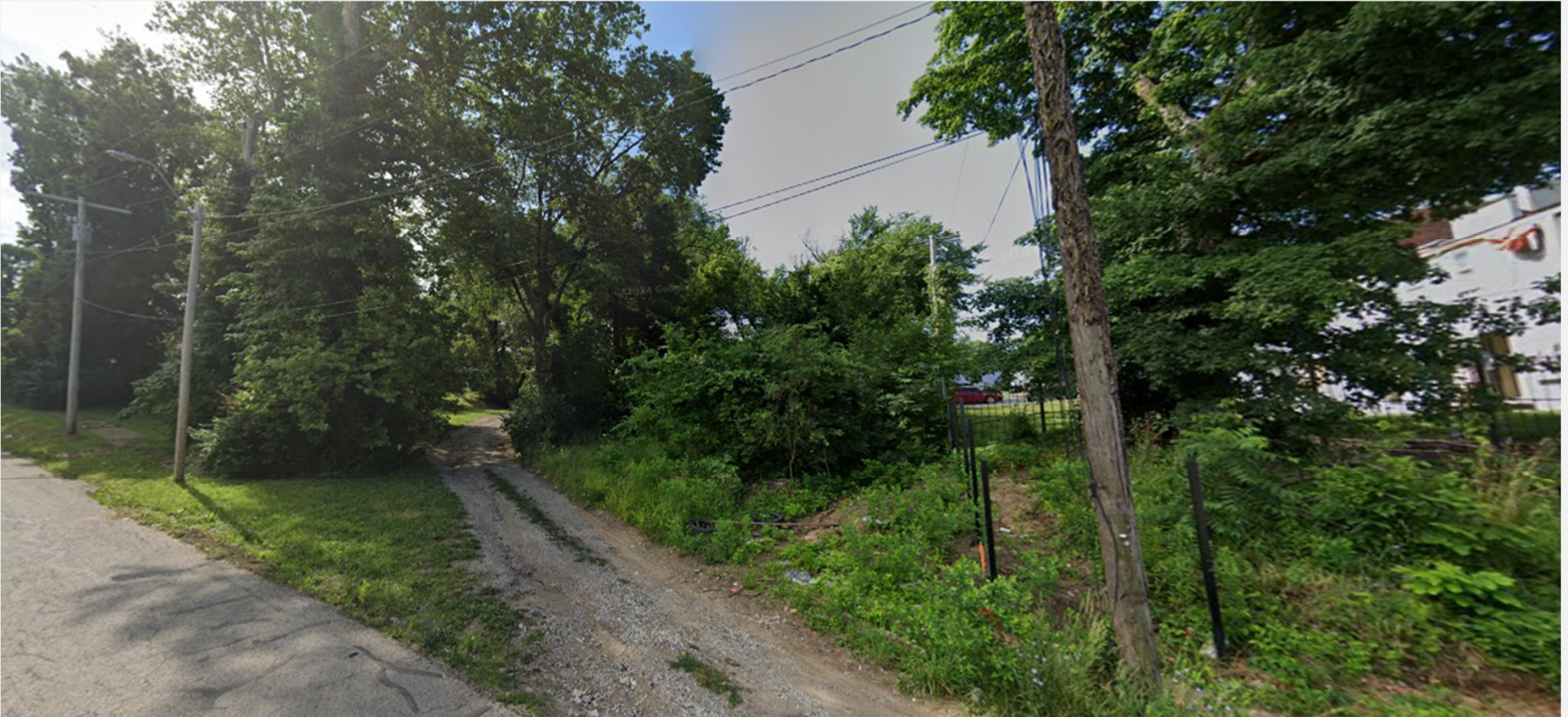
Looking SE from E. 11 th Street