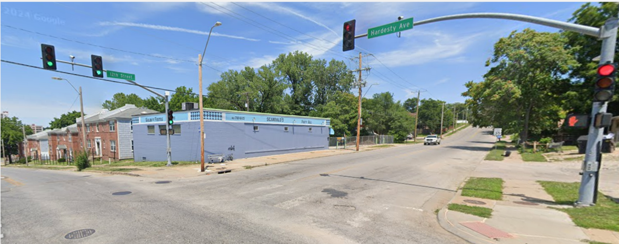
Looking NE at E. 12 th Street & Hardesty Avenue