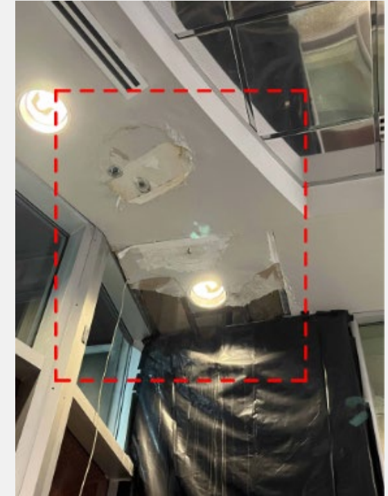
Damaged Ceiling Extending into Lower-Level Lobby

Authorizing a $1,567,455.00 contract with Hartline Construction, LLC, for the RAC Improvement (Phase A) project at the KCI; authorizing a maximum expenditure of $1,724,200.50.