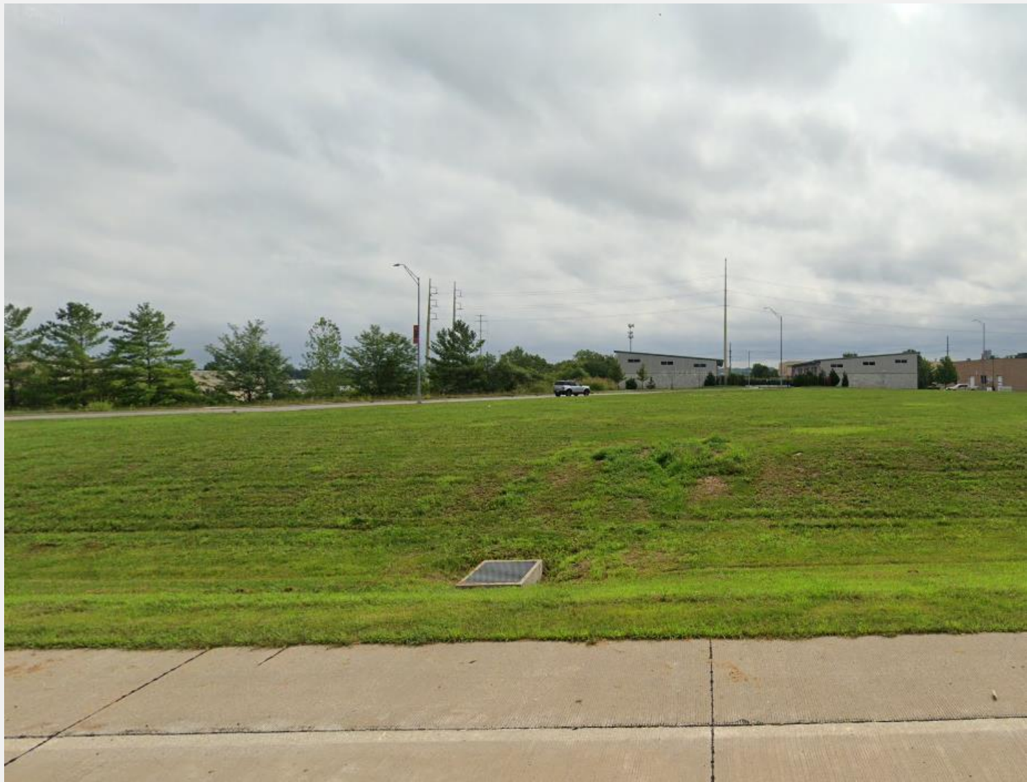
Looking east on 150 HWY. (Aug 2023)