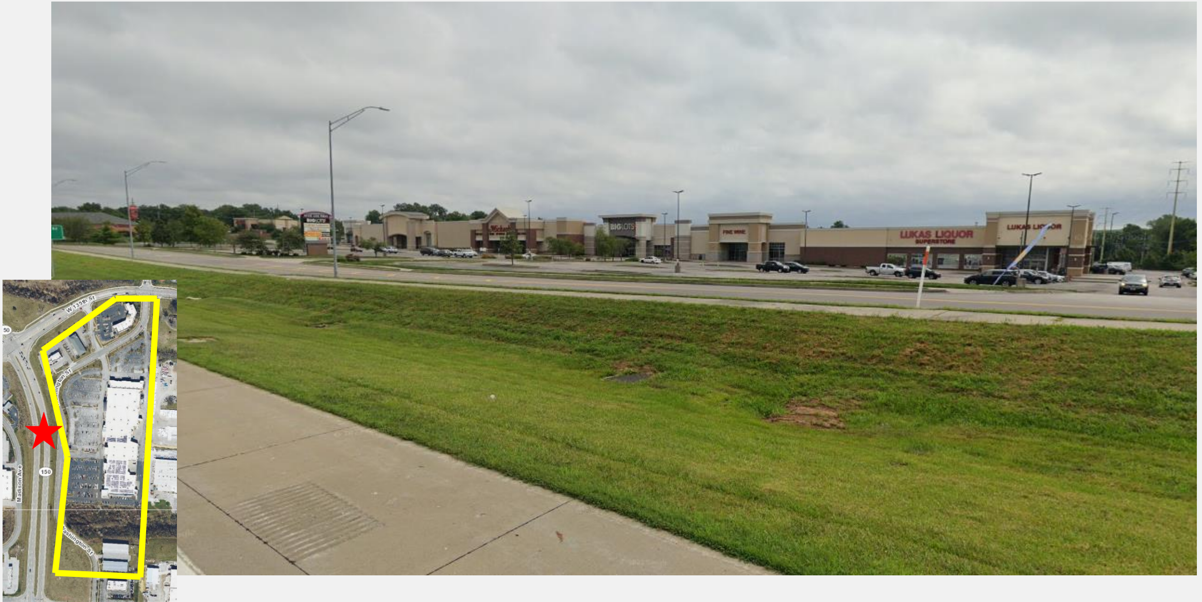
Looking east on 150 HWY. (Aug 2023)