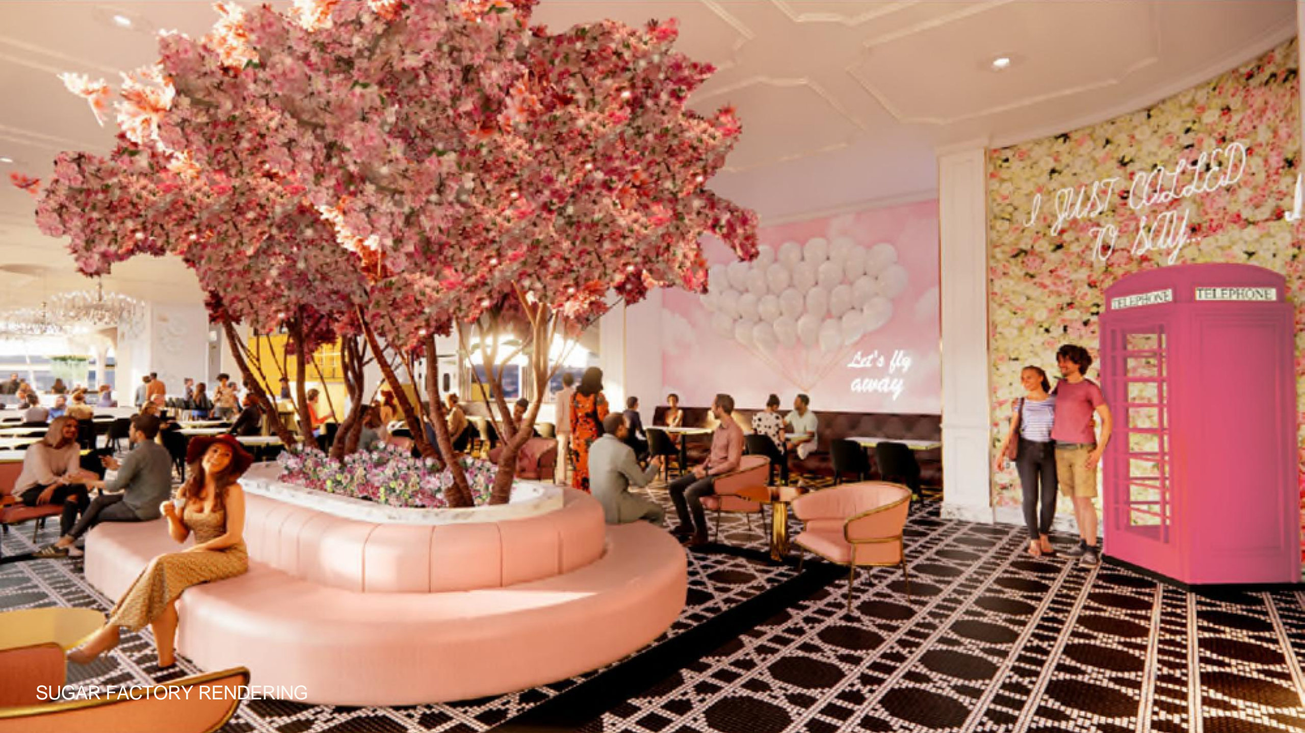
SUGAR FACTORY RENDERING