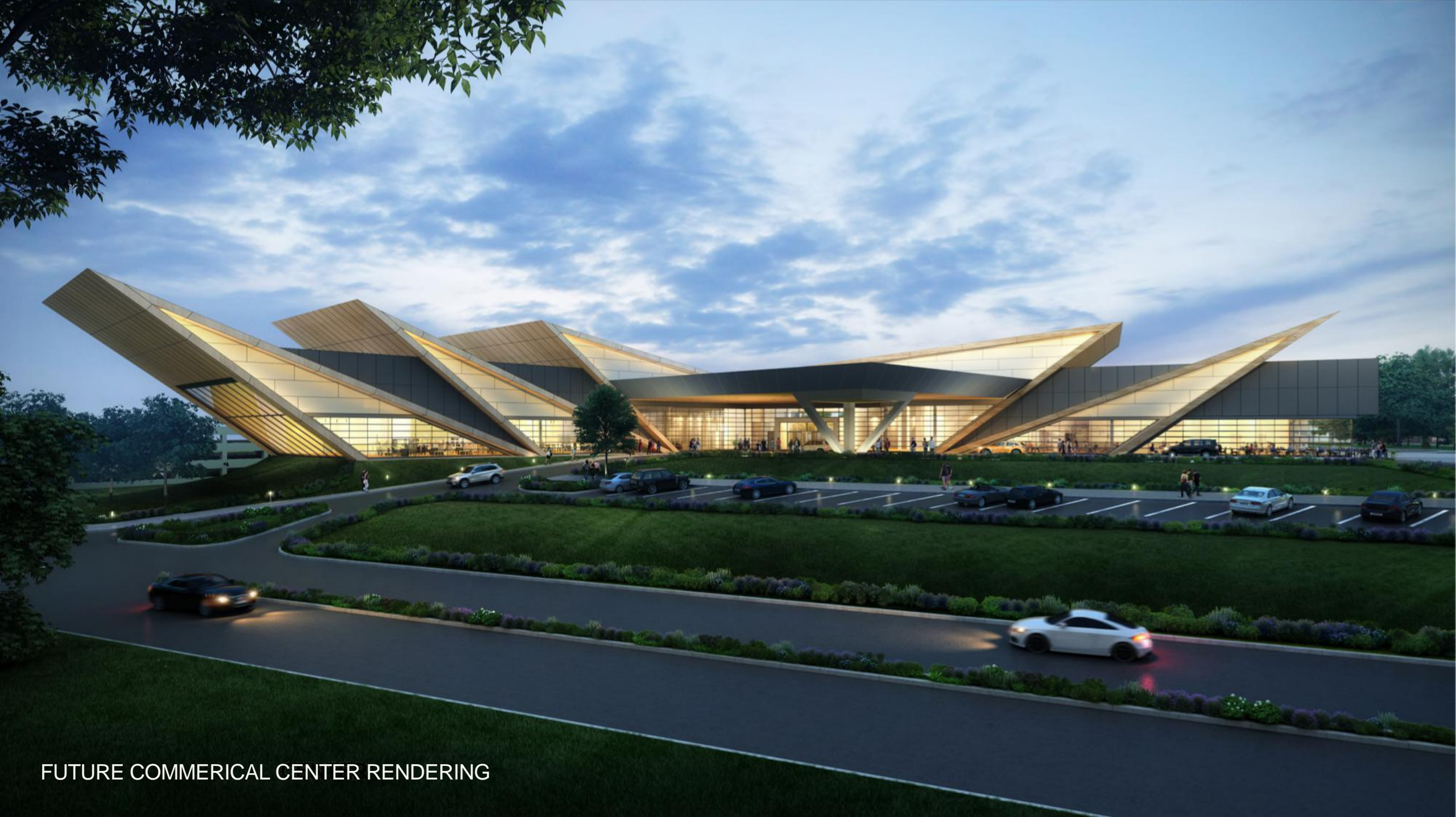
FUTURE COMMERICAL CENTER RENDERING