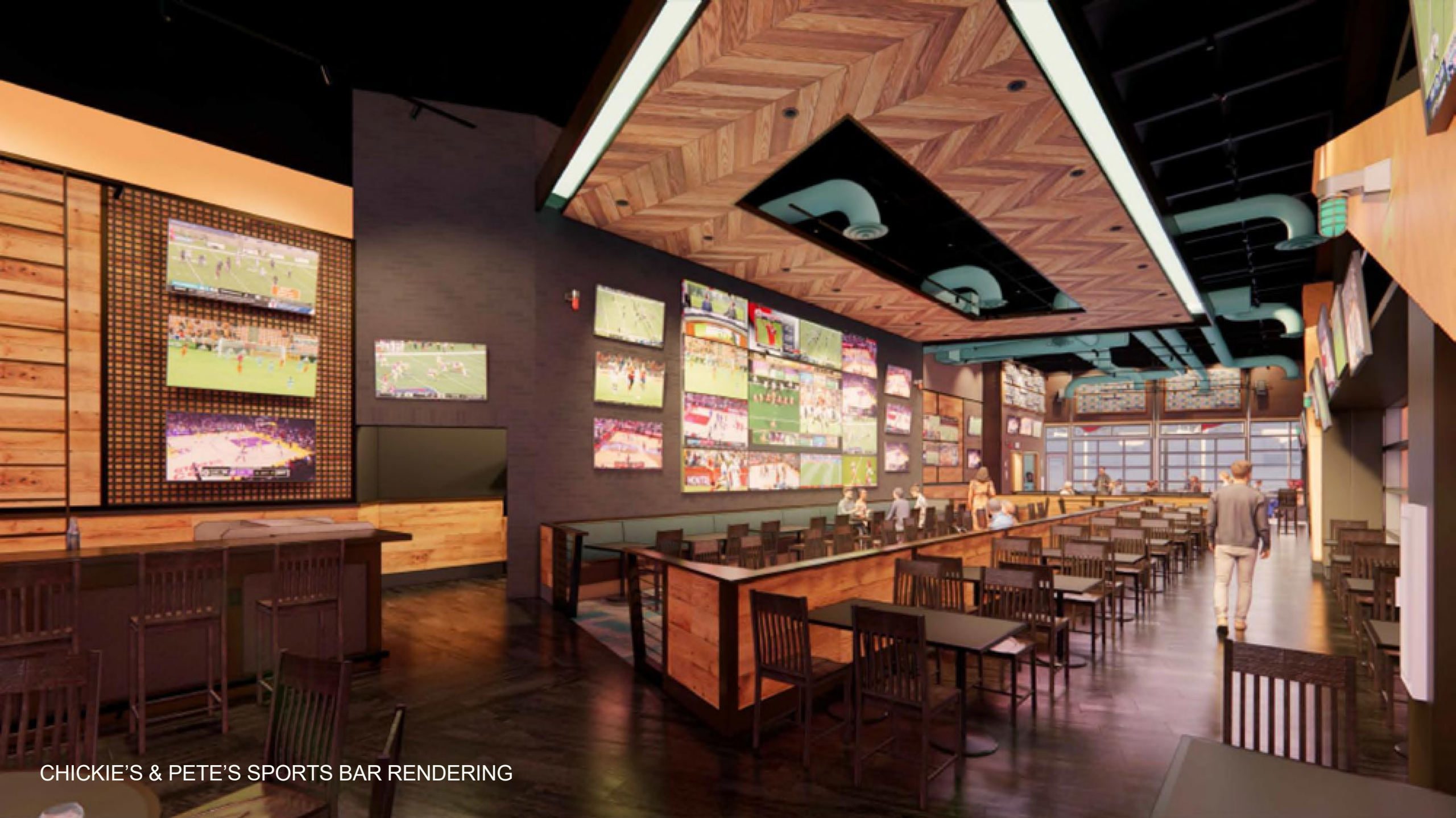
CHICKIE'S & PETE'S SPORTS BAR RENDERING