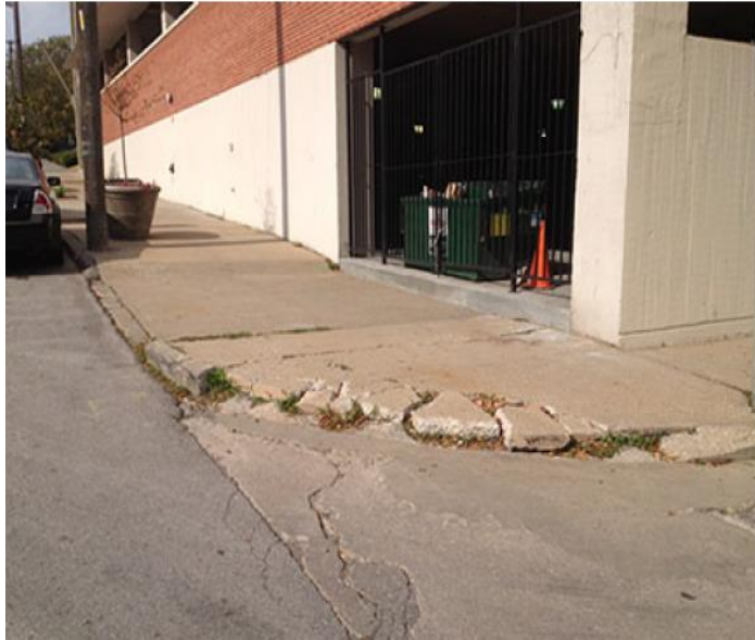
Third & Walnut Streets – Sidewalk Replacement w/ADA