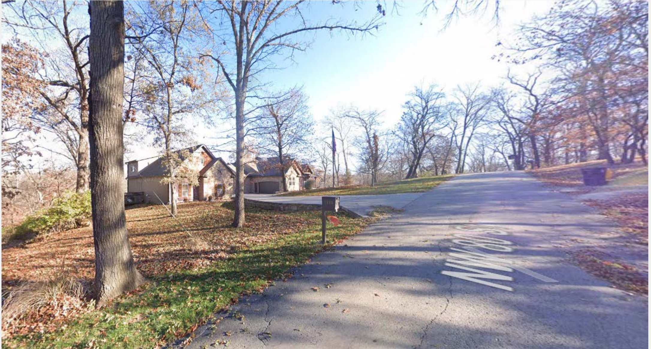
View looking northeast from NW 80 th Street