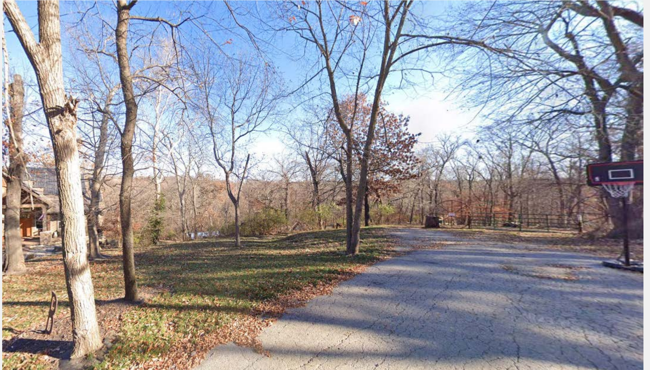
View looking northeast from NW 80 th Street