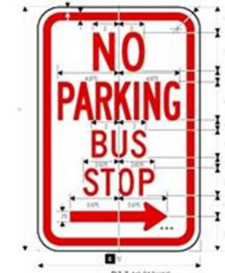
R7-7 NO PARKING

LEGEND - RED (RETROREFL) BACKGROUND - WHITE (RETROREFL)