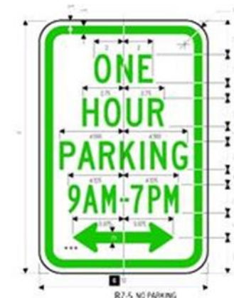
R7-5 NO PARKING

COLORS LEGEND - RED (RETROREFL) BACKGROUND - WHITE (RETROREFL)