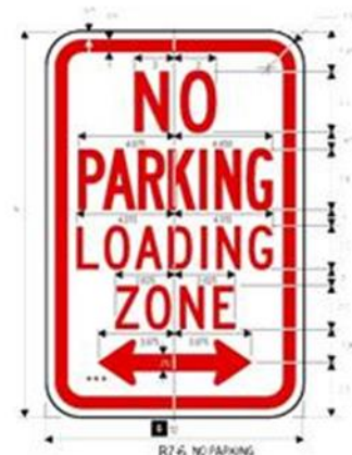
R7-6 NO PARKING

LEGEND - GREEN (RETROREFL) BACKGROUND - WHITE (RETROREFL)