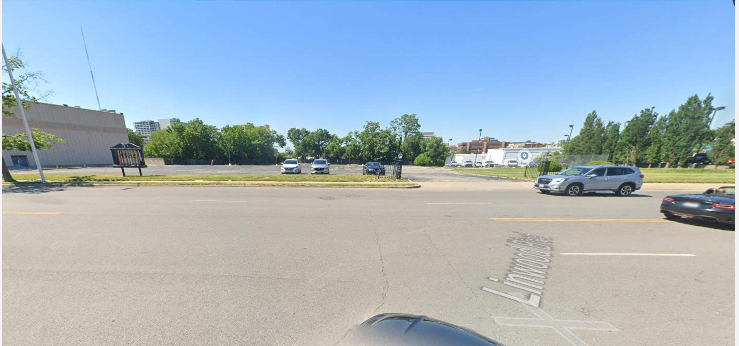
Looking towards on W Linwood Blvd & Baltimore Ave. (June 2024)