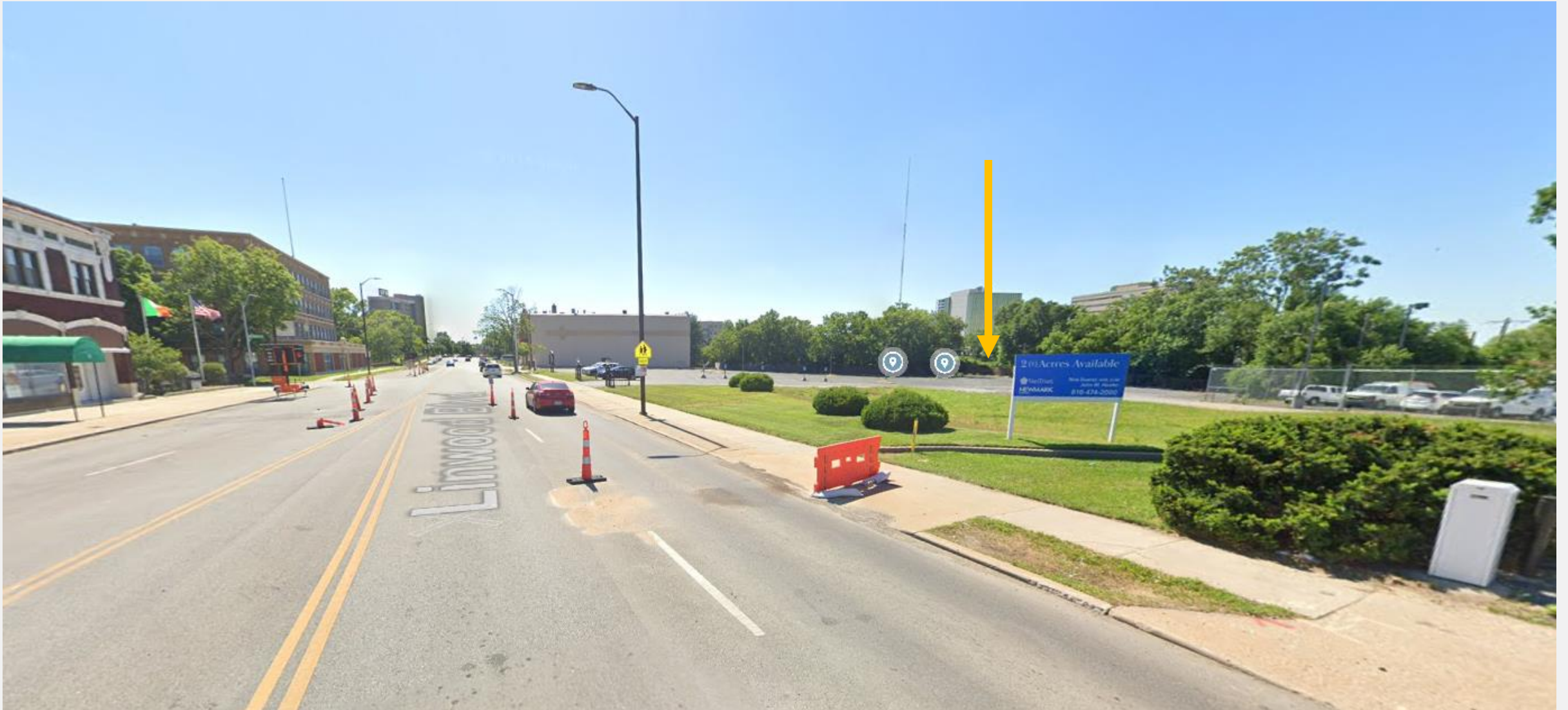
Looking west on Linwood Blvd (subject site on right). (June 2024)