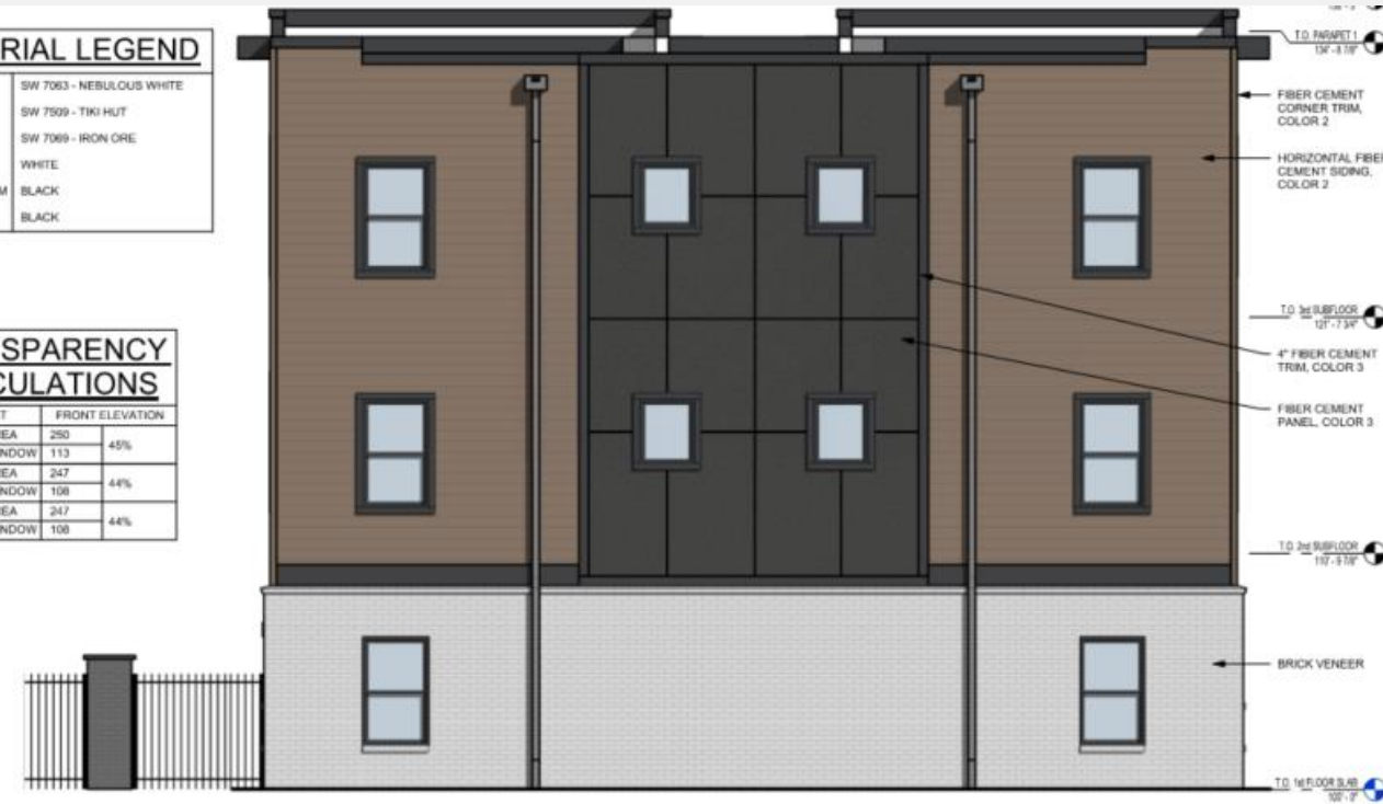
2 BACK ELEVATION 1/4" = 1'-0"