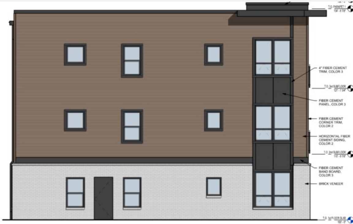
3 SIDE ELEVATION 1/4" = 1'-0"