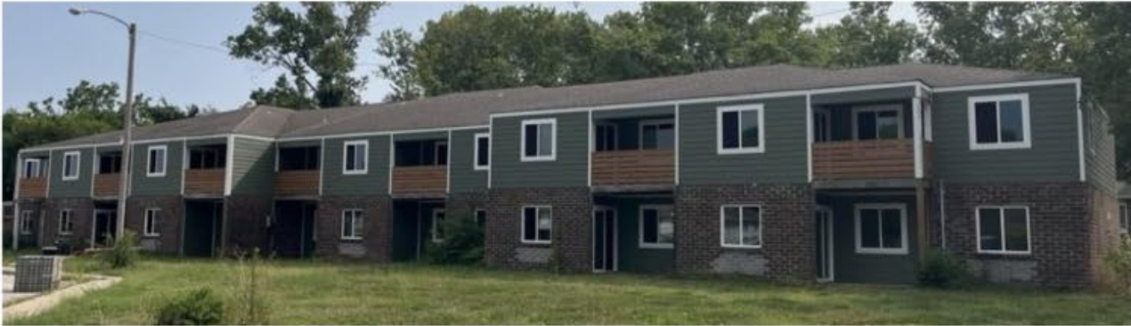
BUILDING 400 NORTHEAST ELEVATION