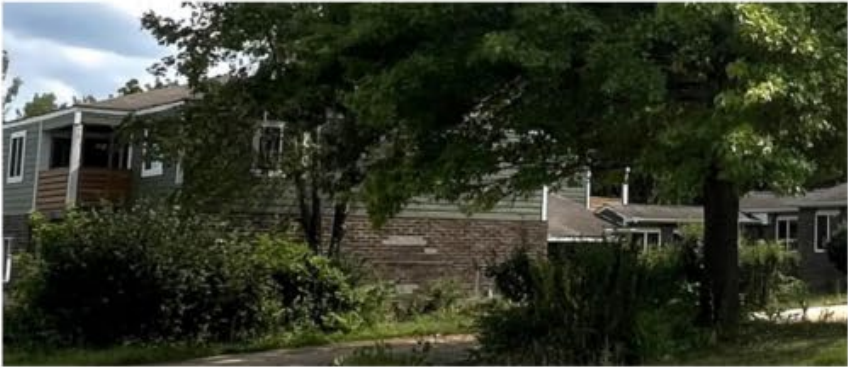
BUILDING 400 NORTHWEST ELEVATION