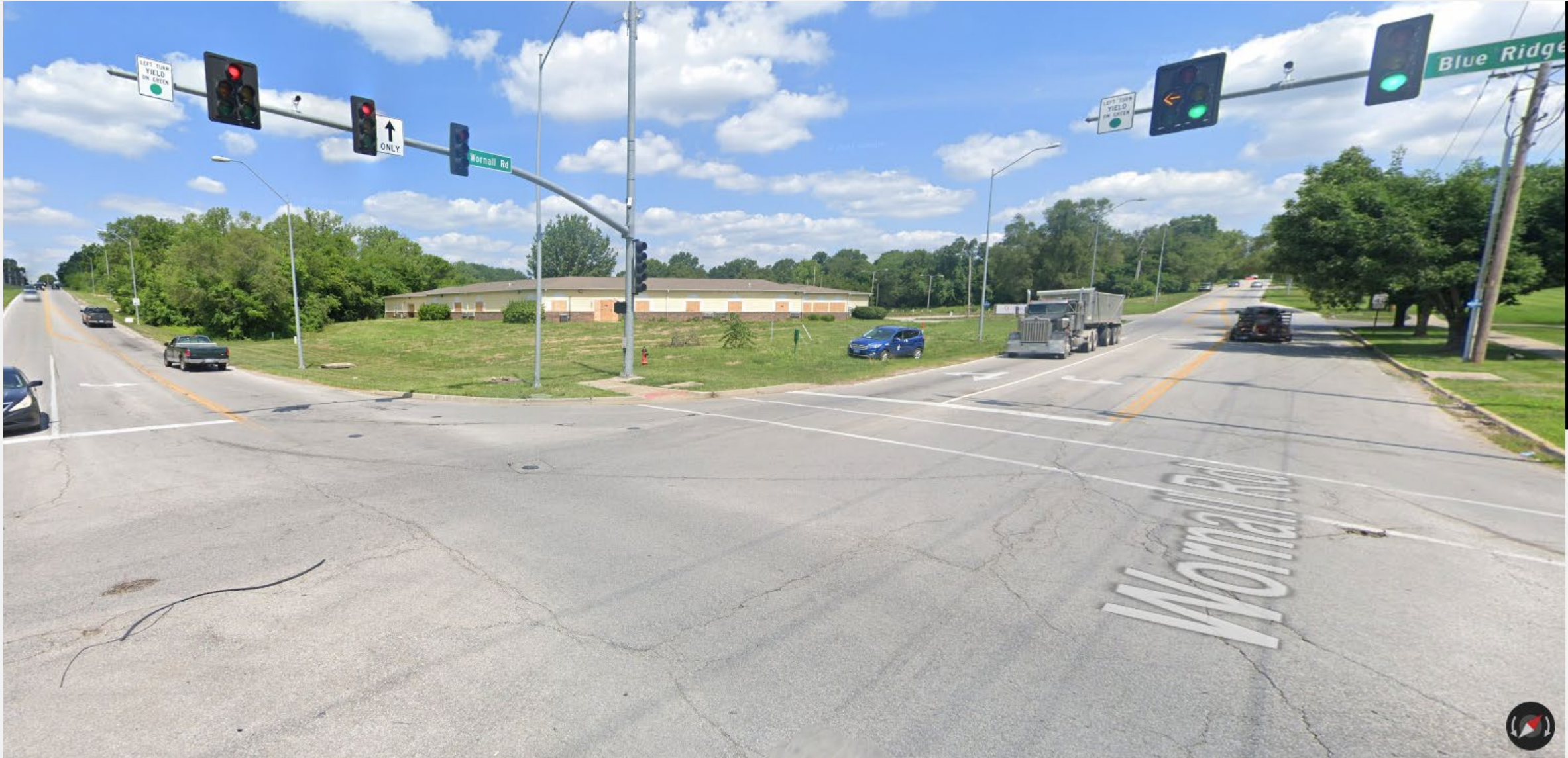
View towards site from Wornall Rd and Blue Ridge Blvd (July 2021)