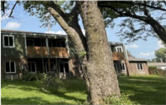
BUILDING 400 SOUTHWEST ELEVATION