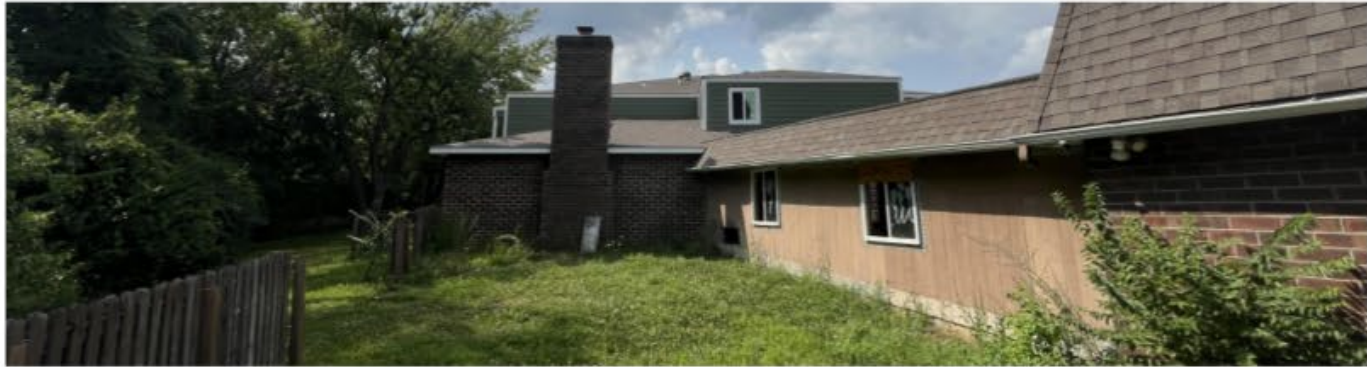
BUILDING 400 SOUTHEAST ELEVATION