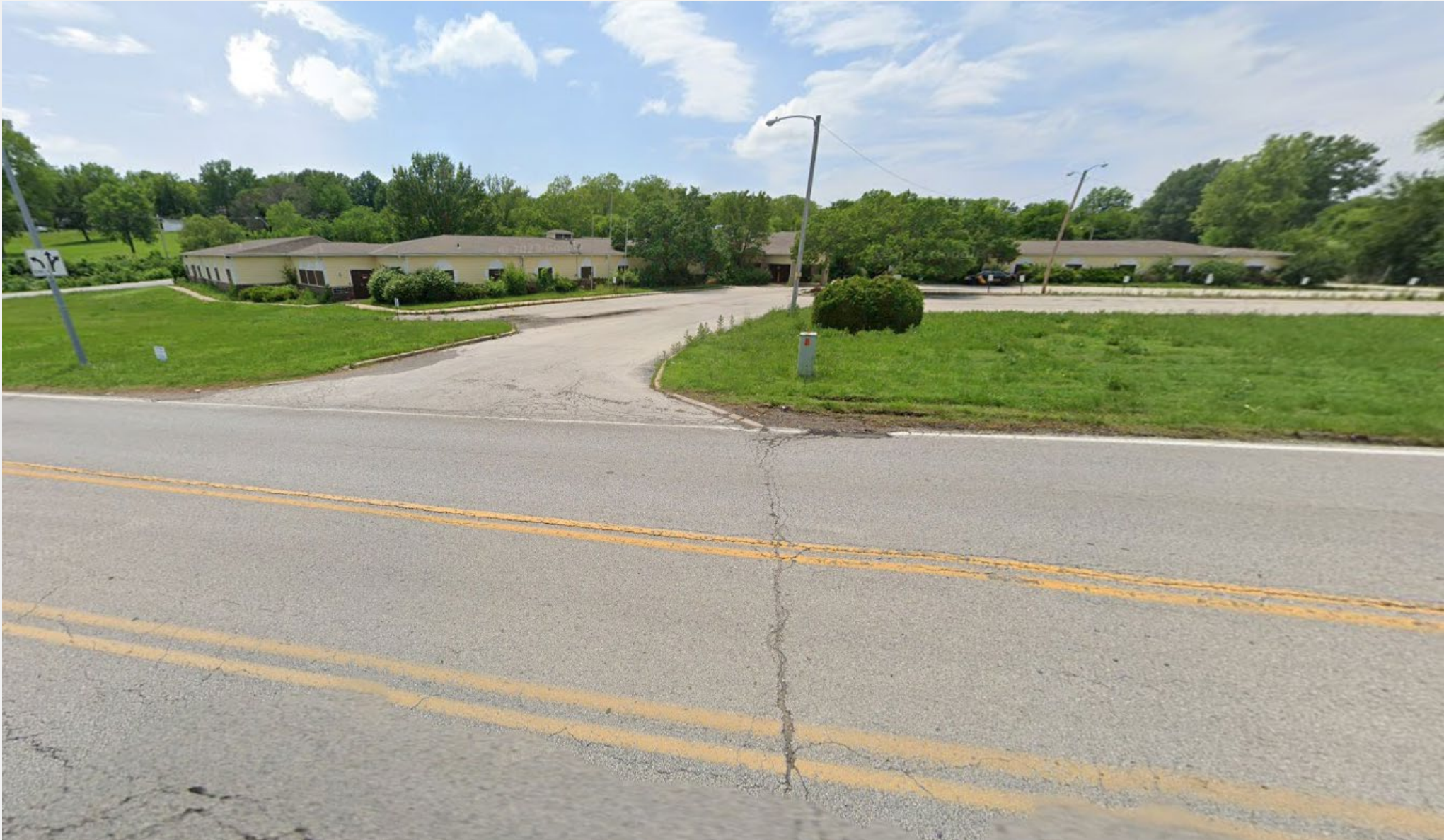
View of subject site from Wornall Rd (May 2023)