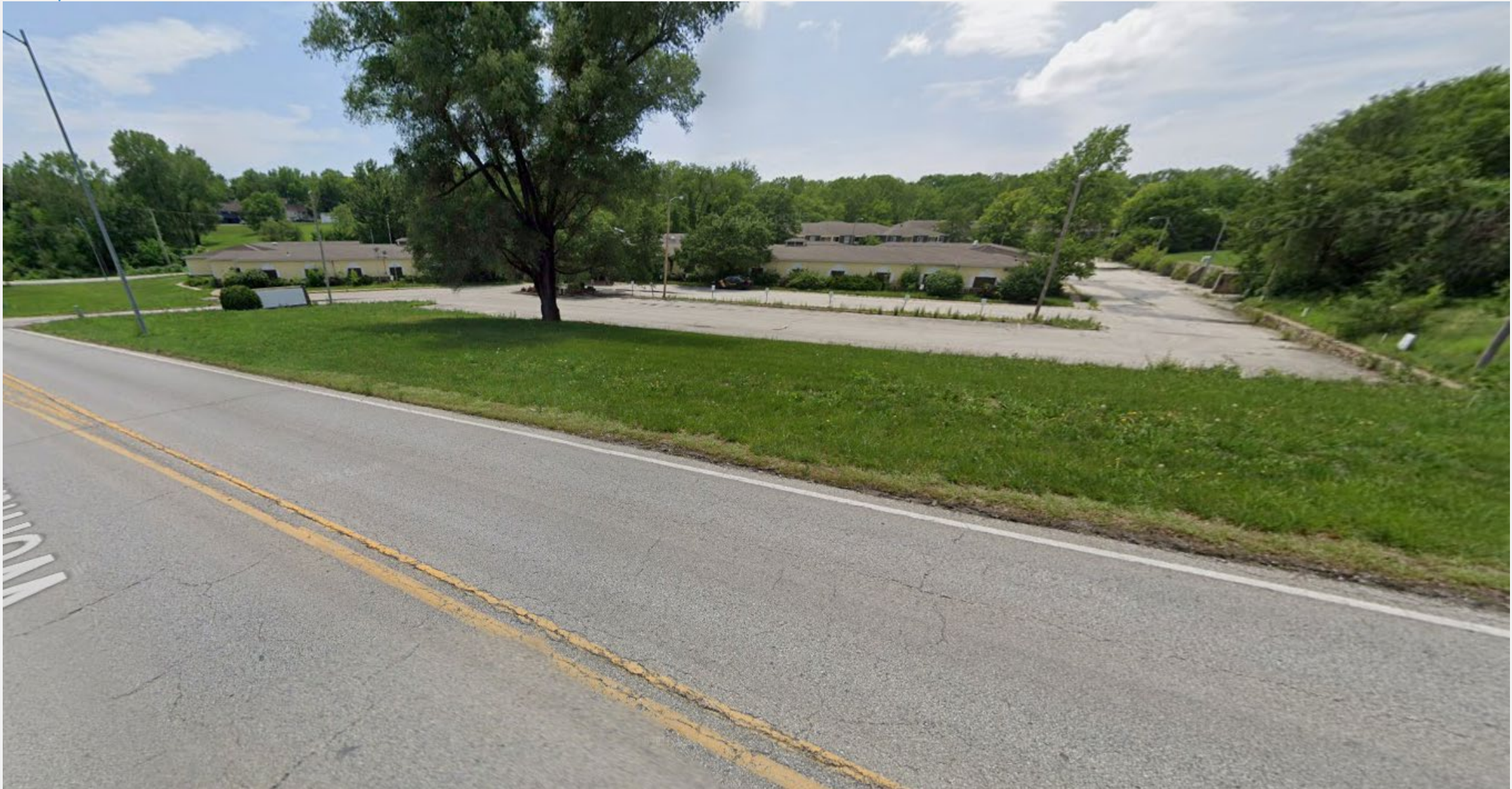
View towards site from Wornall Rd (May 2023)