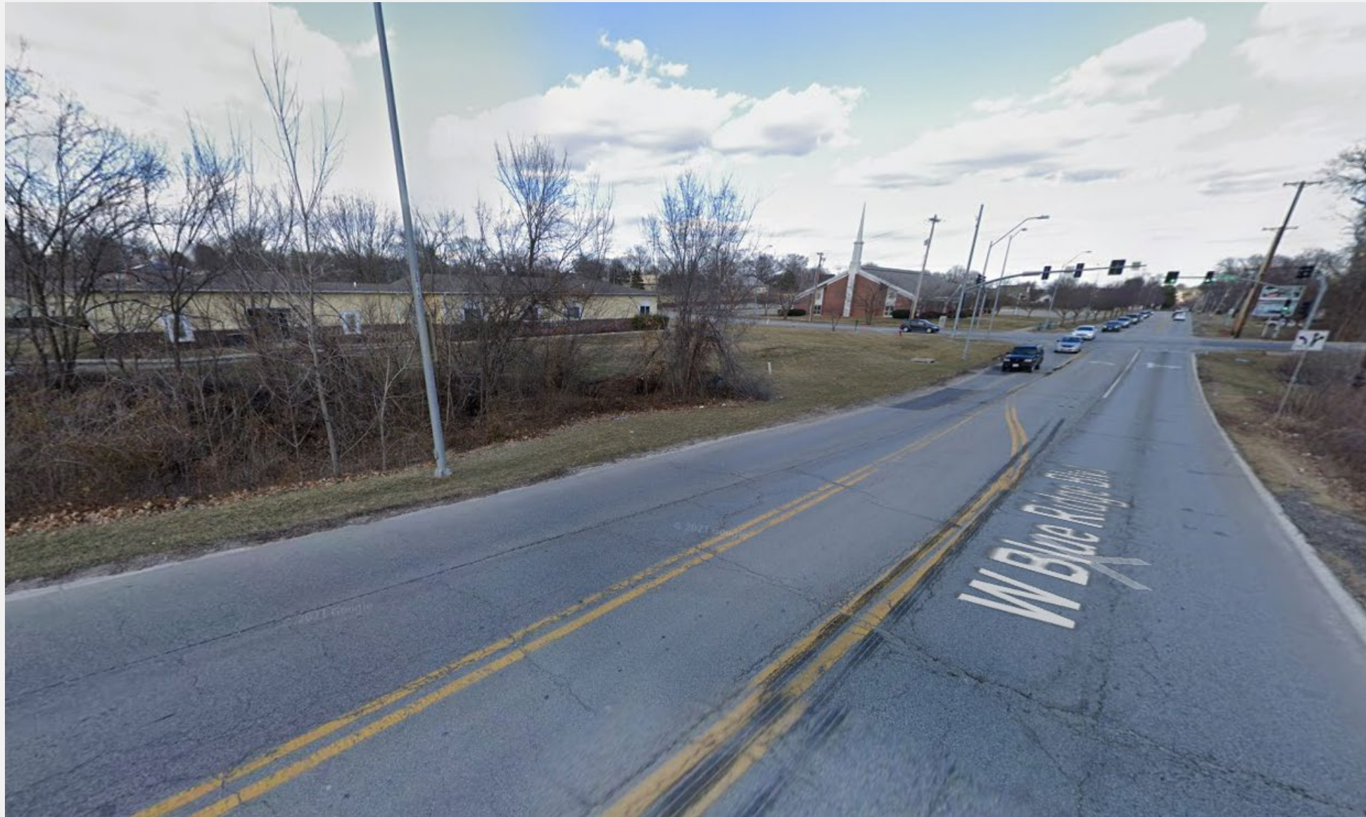
View northeast towards site from Blue Ridge Blvd (March 2019)