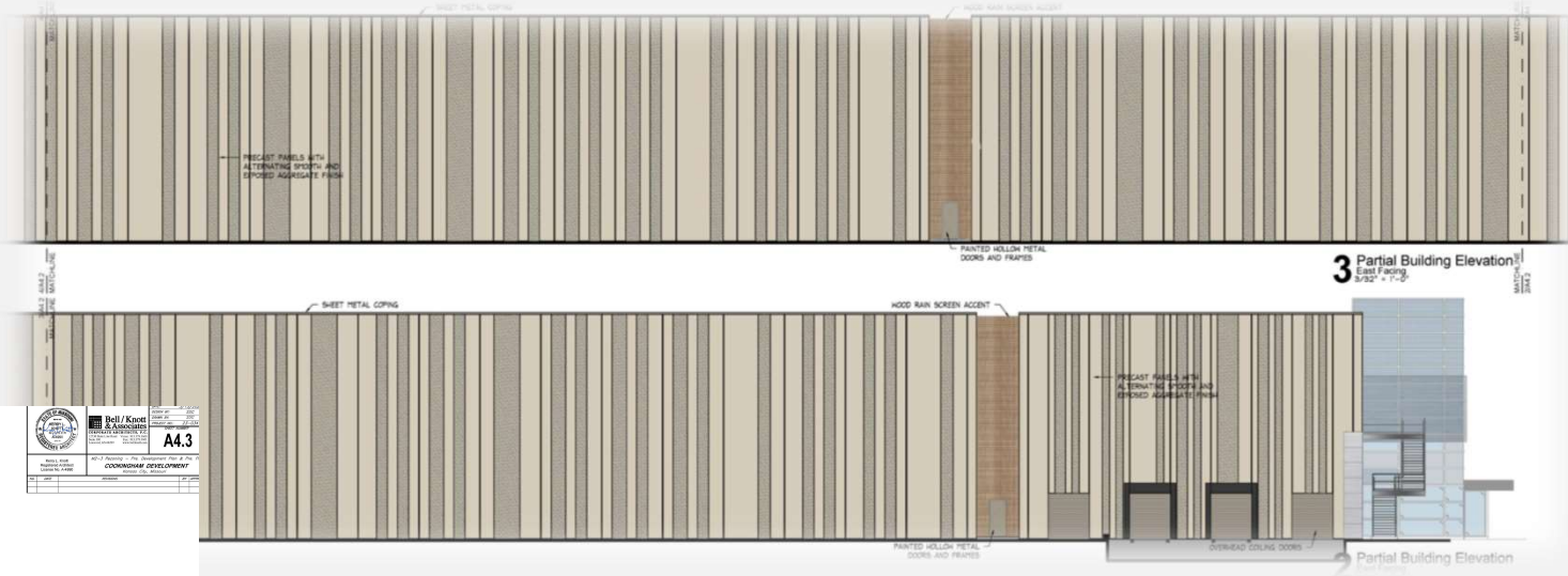
3 Partial Building Elevation East Facing 5/32" = 1'-0"