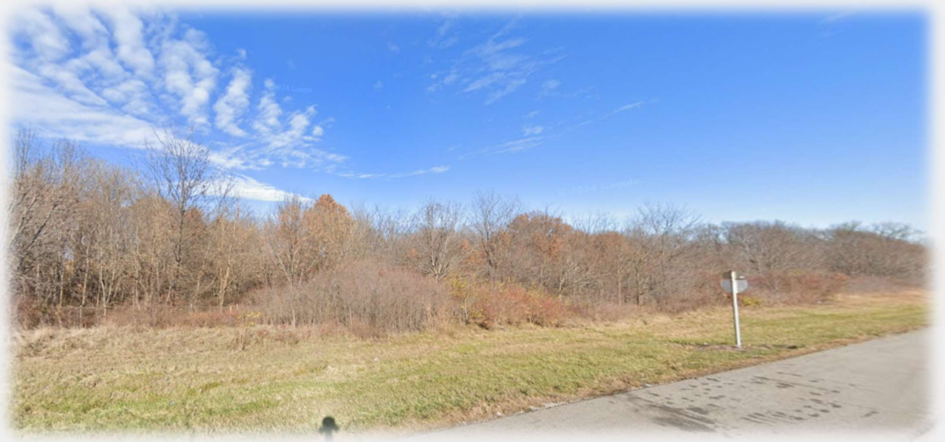
View looking northwest from Interstate 435