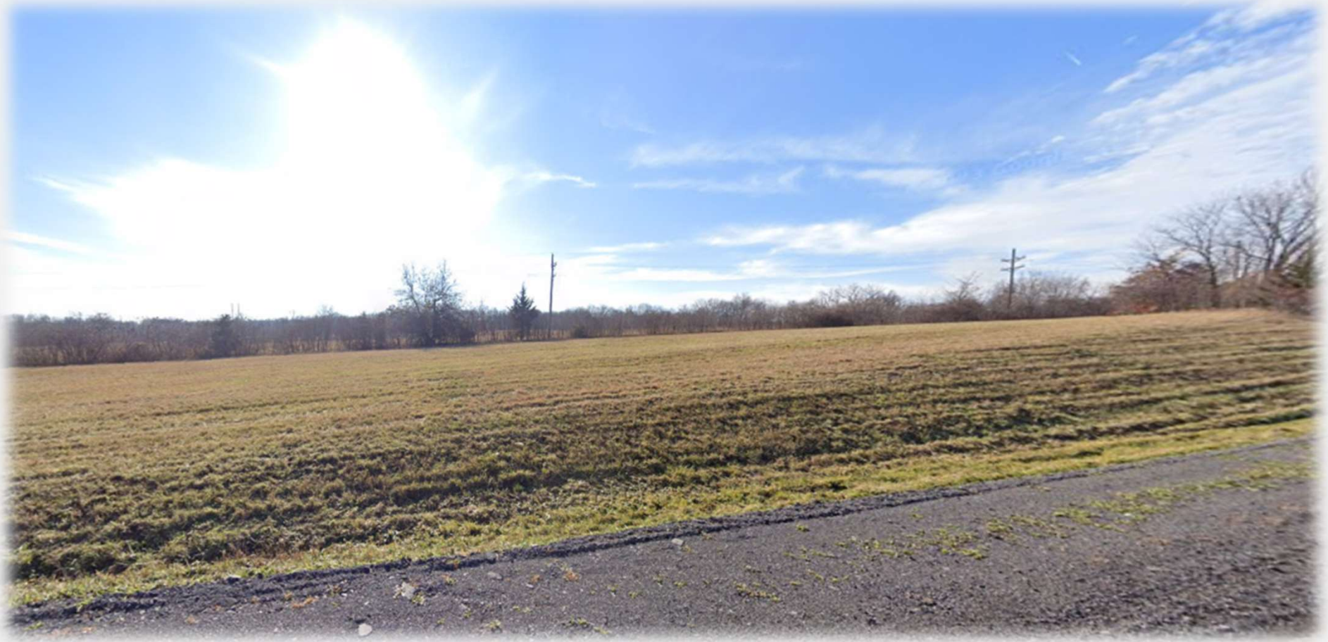
View looking southwest from NW Cookingham