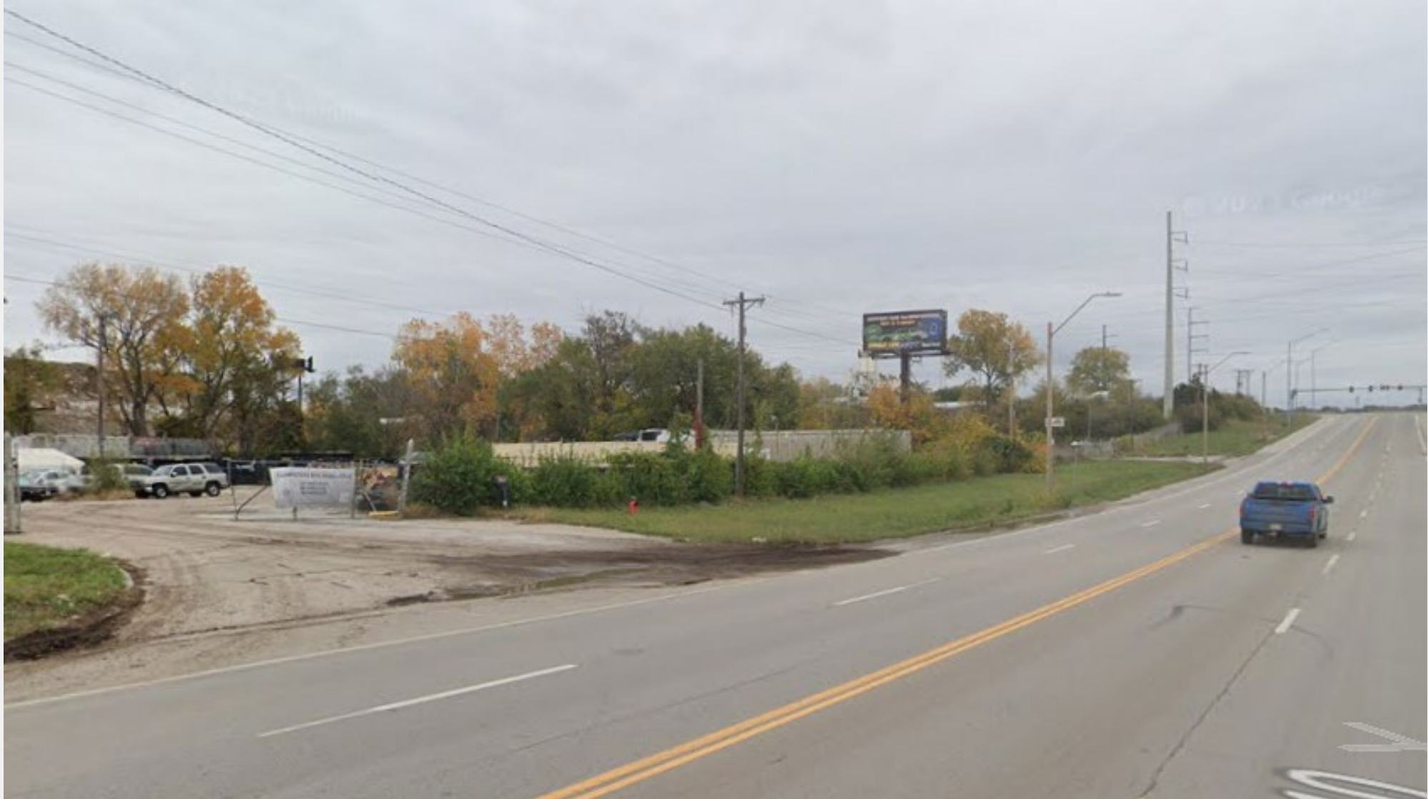
View looking east from Highway 40