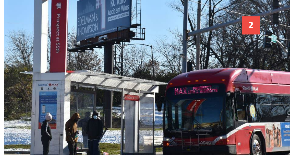
5. Increase Mobility & Connectivity for All