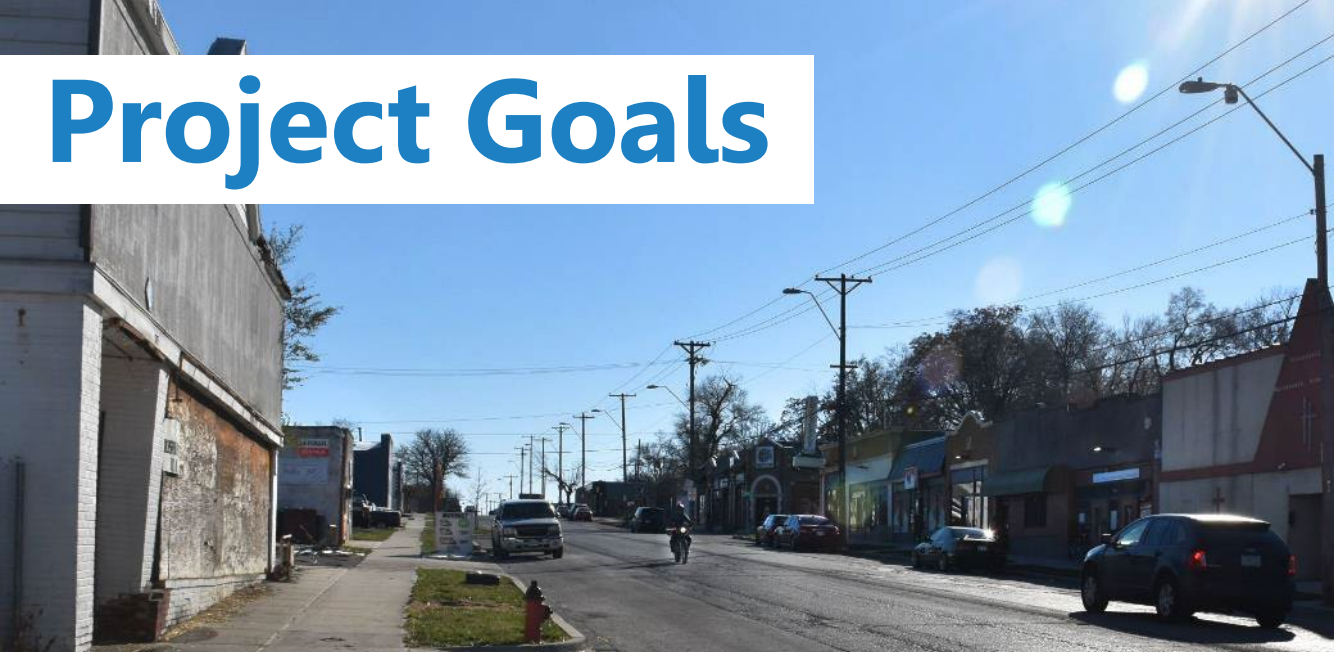
1. Holistic Community Development