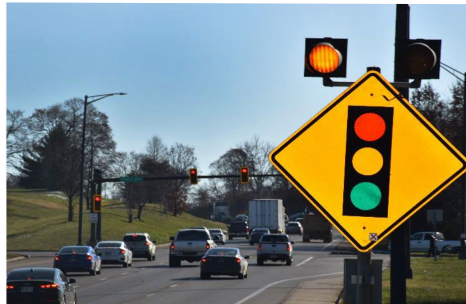
3. Feasibility & Appropriateness of Potential Approaches