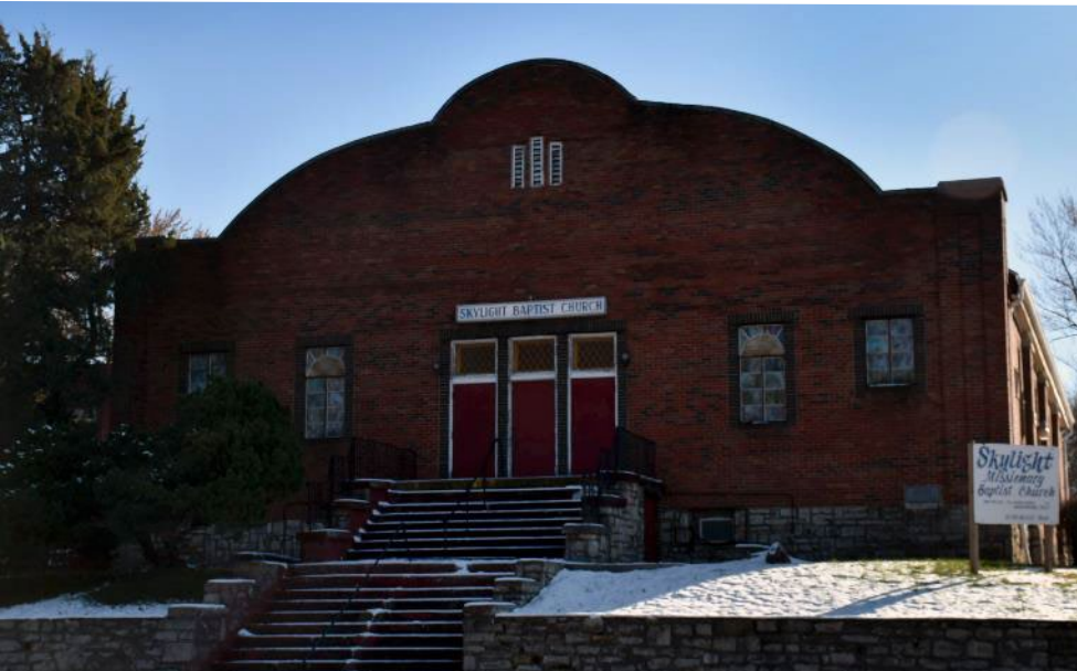
2. Focus on the Community