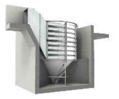
NEW GRIT HEADCELL - EAST END