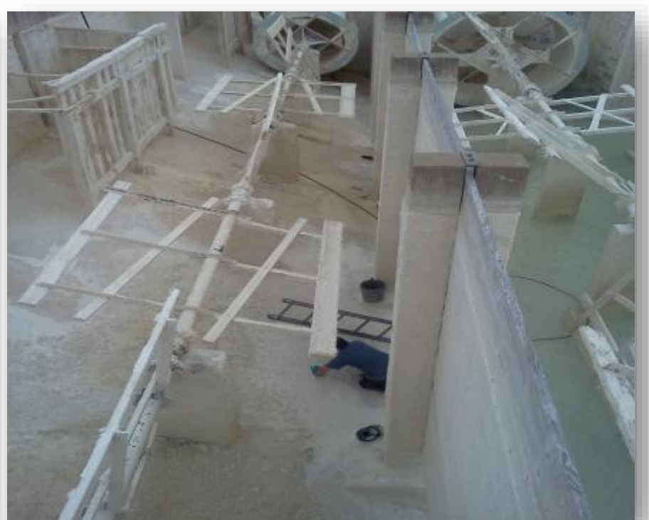
Secondary Basins Before and After Cleaning