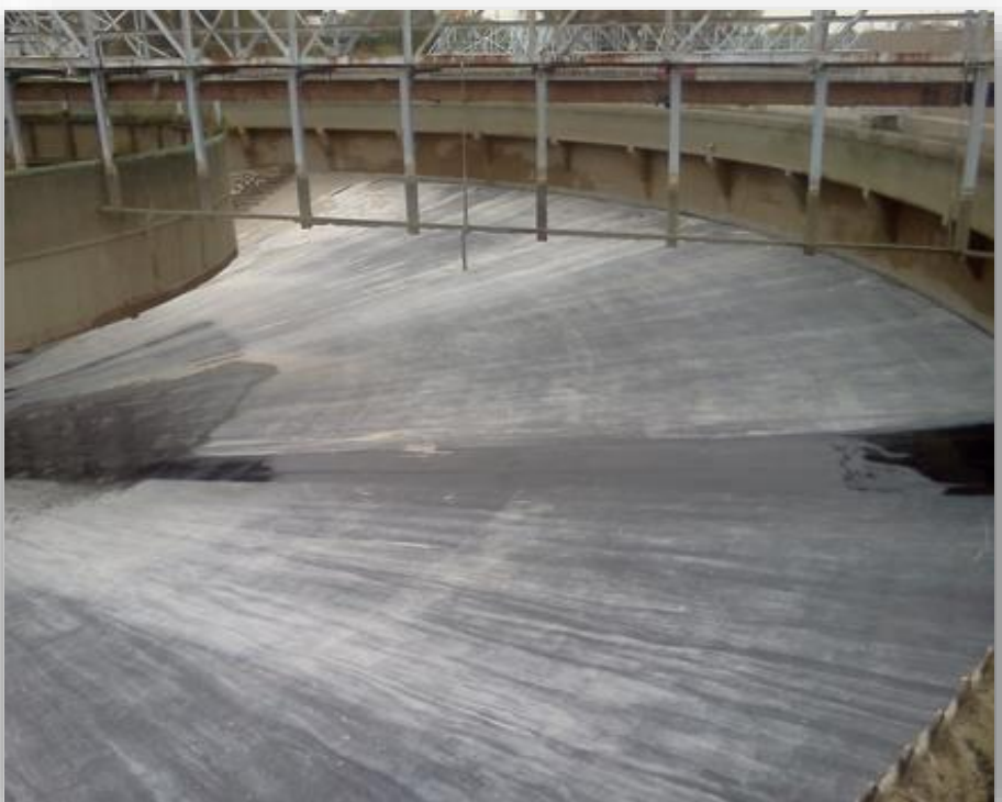
Primary Basins Before and After Cleaning