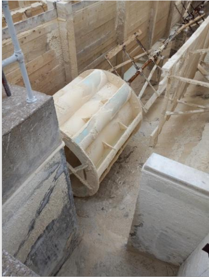
Secondary Improvements Project and Damaged Paddle on Air Wheel