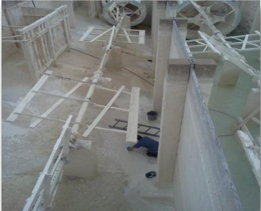
Secondary Basins Before and After Cleaning