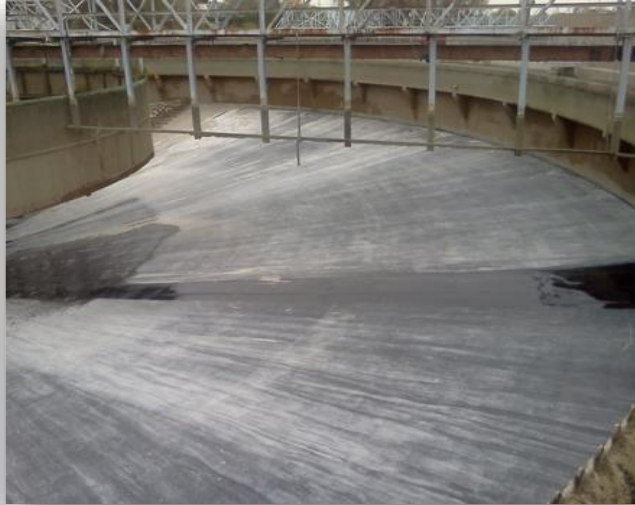
Primary Basins Before and After Cleaning