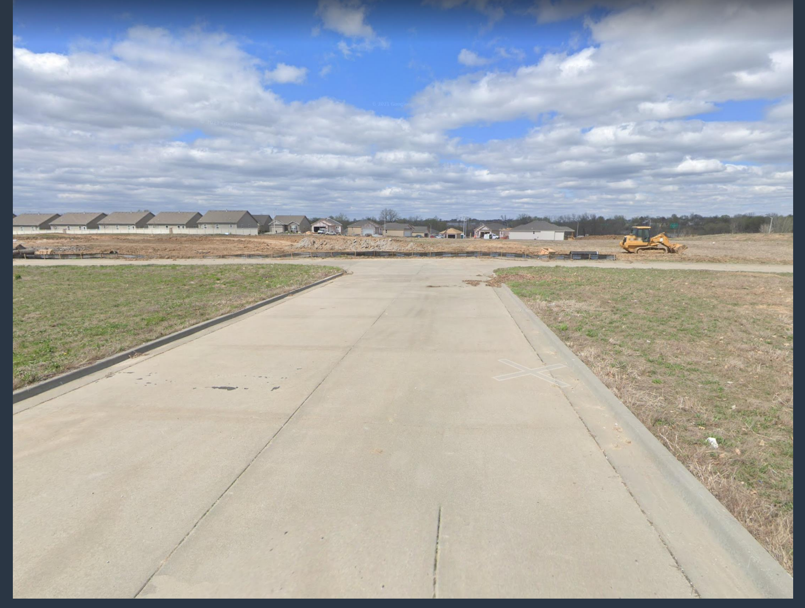
View looking north from NW Shoal Creek Pkwy & private drive