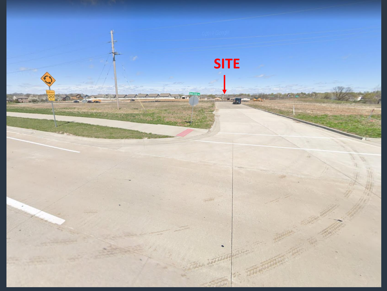
View looking north from NW Shoal Creek Pkwy & private drive