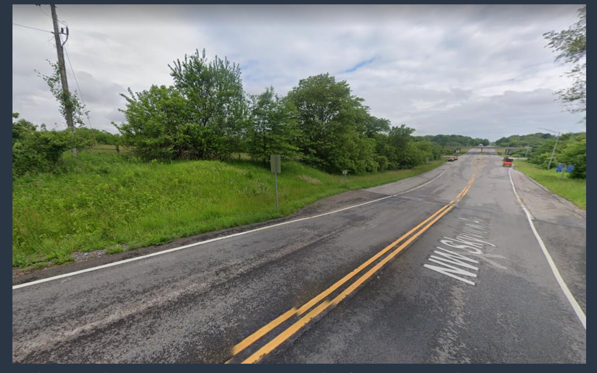
View looking northwest towards the site from NW Skyview Ave