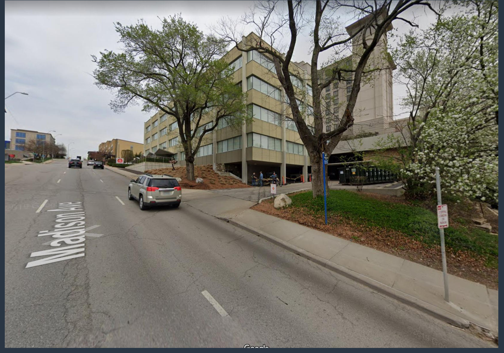
View looking north towards the site from Madison Ave