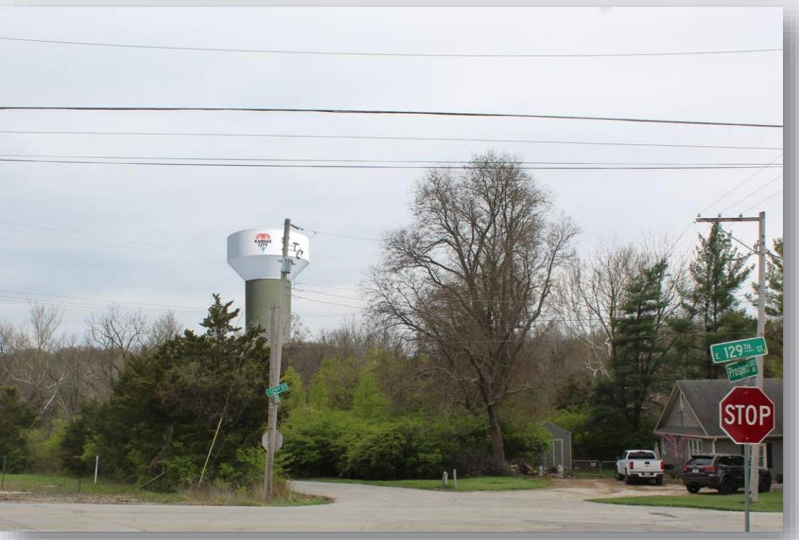
Proposed Prospect Elevated Water Tank views from Robinson Pike Road and 129<sup>th</sup> and Prospect in south Kansas City, Missouri