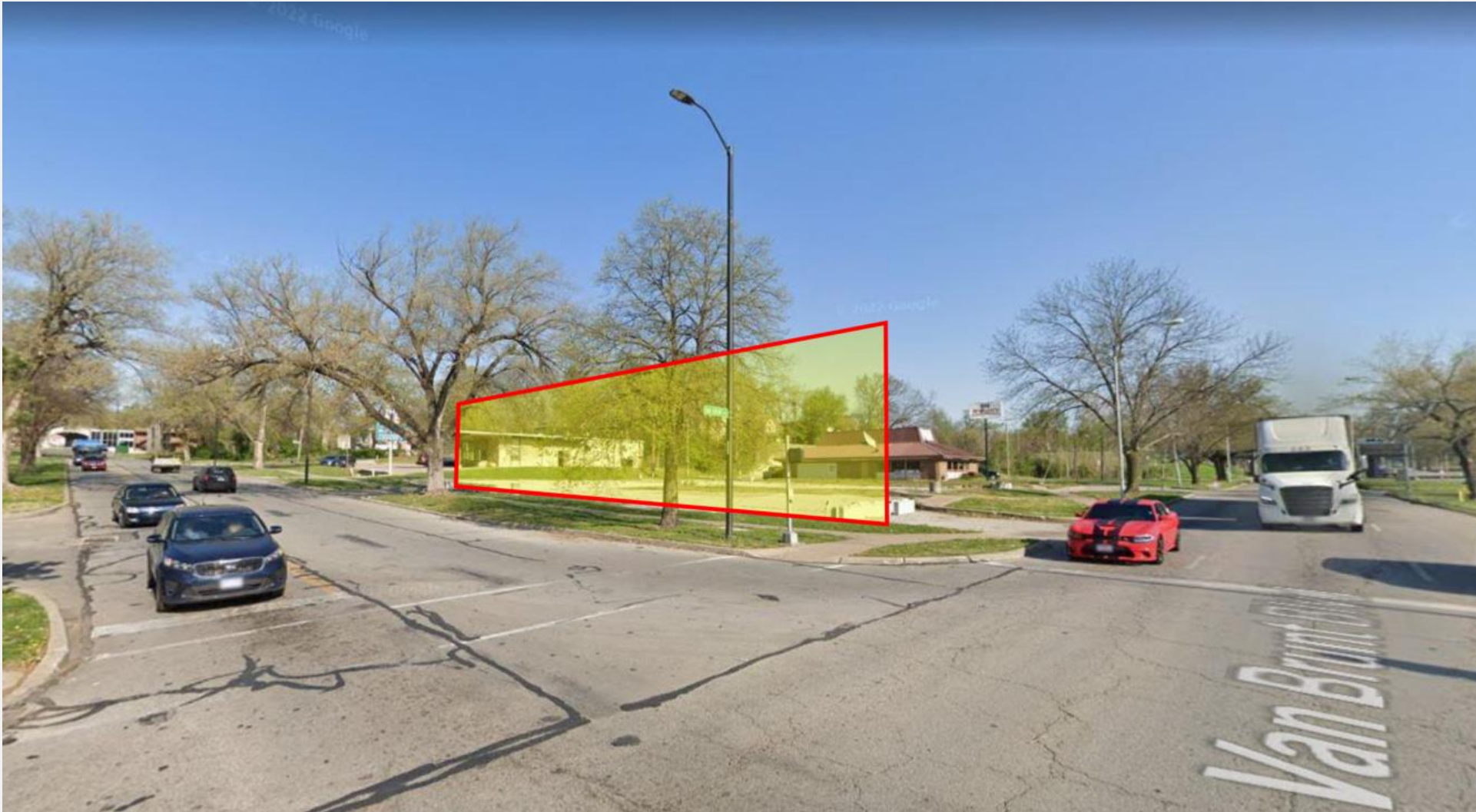
View looking northwest from Linwood & Van Brunt Boulevard