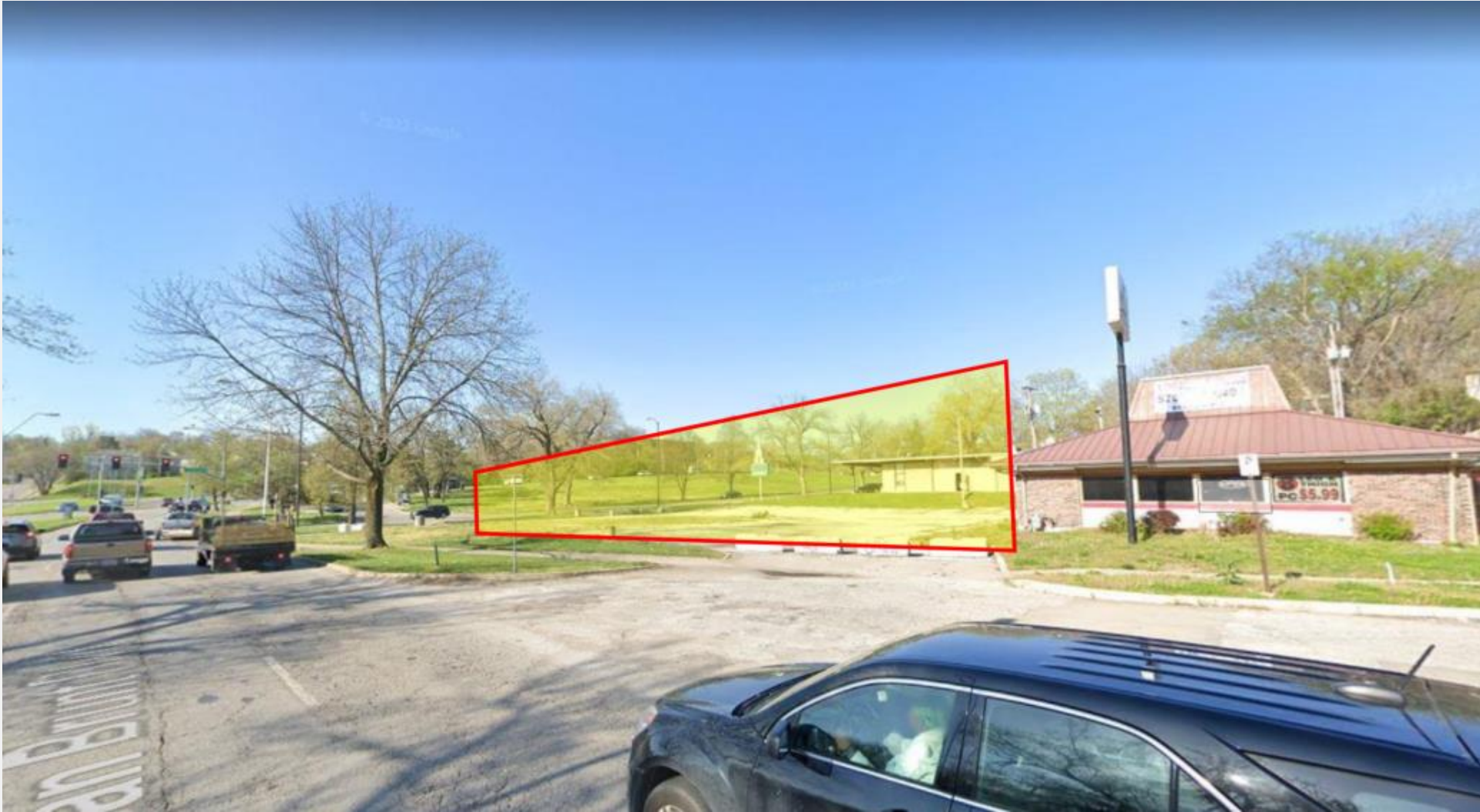
View looking southwest from Van Brunt Boulevard