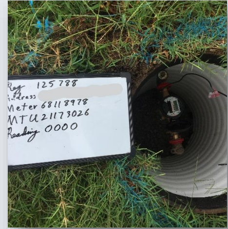
Automated Metering Equipment and Installation