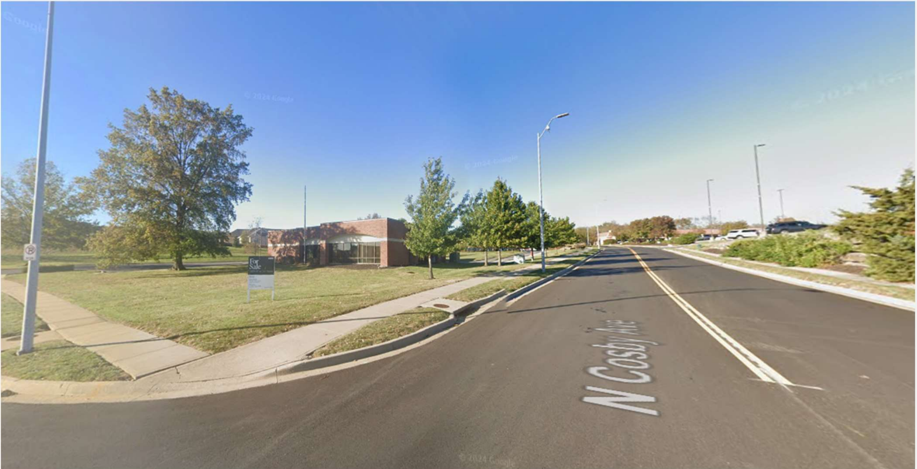
View looking north on N. Cosby Avenue