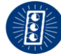
Backplates with Retroreflective Borders