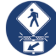
Rectangular Rapid Flashing Beacons (RRFB)