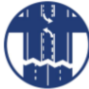
Road Diets (Roadway Reconfiguration)