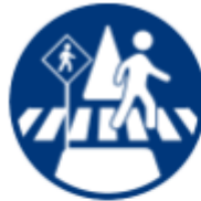
Medians and Pedestrian Refuge Islands in Urban and Suburban Areas