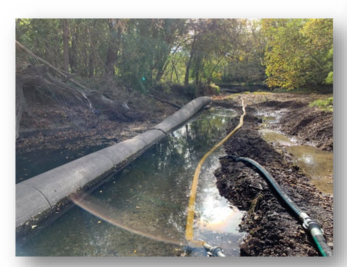
Site 42- Dyke Branch at Holmes Road / $1,500,000 estimated cost / temporary emergency repair already completed