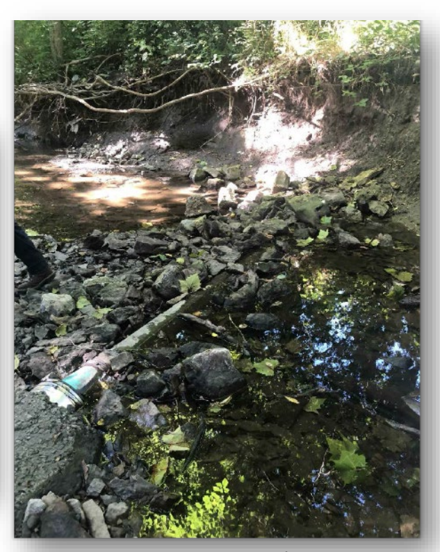
Site 34 - N171-004 / $220,000 estimated cost