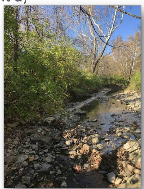
Site 36 - S084-191 / $818,000 estimated cost