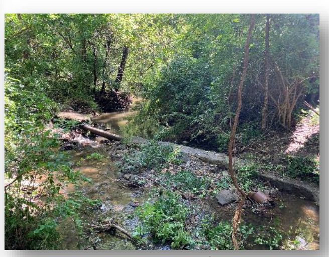
Site 41 - N039-100 / $173,000 estimated cost / temporary emergency repair already completed