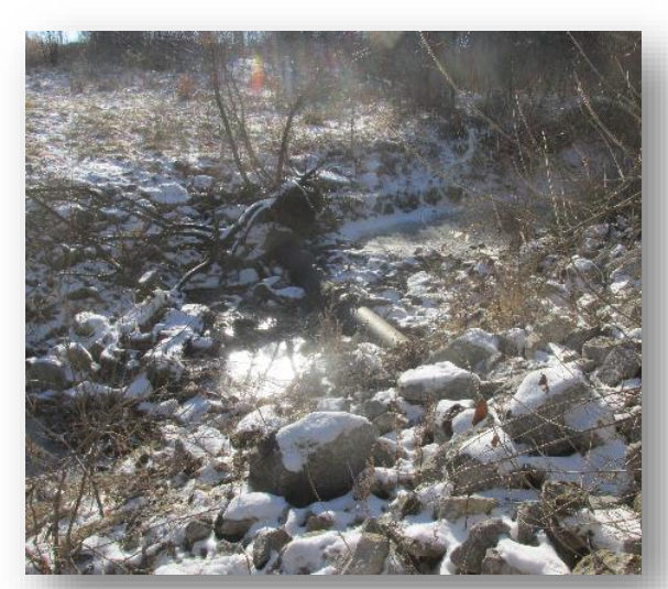
Site 35 - N190-045 / $468,000 estimated cost