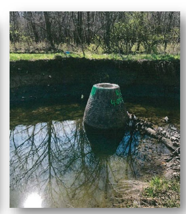
Site 31 - N114-014 / $1,032,000 estimated cost