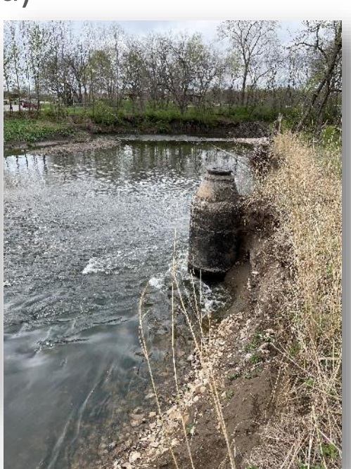
Site 43 - Tomahawk WWTP