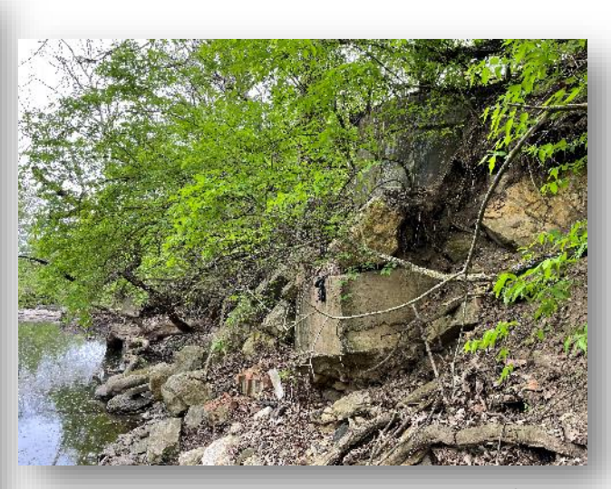
Site 44 - 408 E Bannister Road