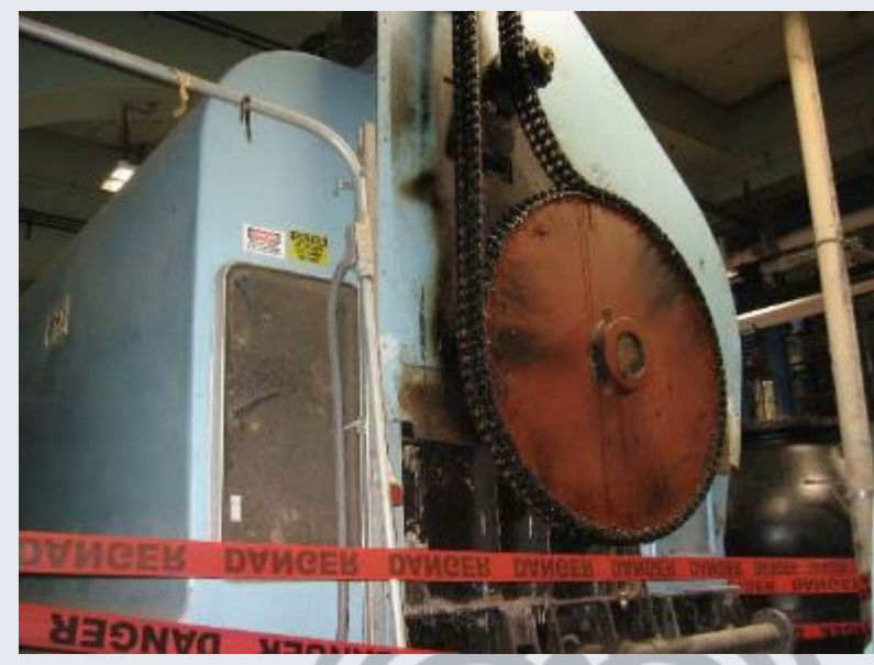
Housing for the River Intake Traveling Screens