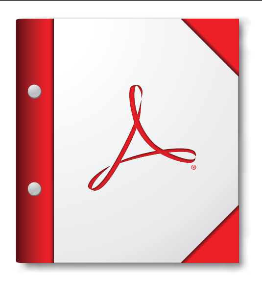
For the best experience, open this PDF portfolio in Acrobat X or Adobe Reader X, or later.